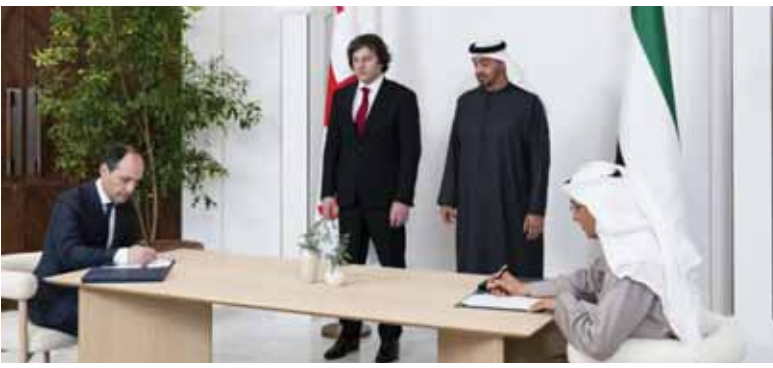
PM Kobakhidze with Sheikh Mohamed.

This landmark investment is expected to attract more foreign interest, accord-