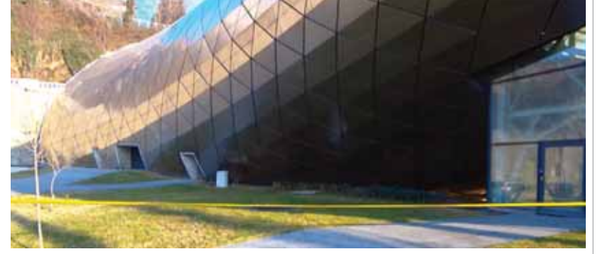
Scene of the incident in Rike Park

scale project aiming to build stadiums in over 40 municipalities. The decision was overviewed at the meeting which included Tbilisi Mayor Kakha Kaladze, Sports Minister Shalva Gogoladze, and Infrastructure Minister Irakli Karseladze, where they discussed the initiative's potential to attract investments and international events.