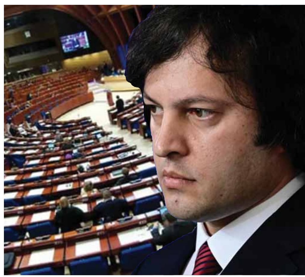
PM Kobakhidze: Our delegation will not continue participating in the Parliamentary Assembly under these circumstances.