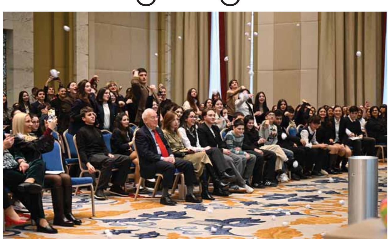
The national linguistic competition at Biltmore Hotel.

Speak Up London School in the UK, where they will continue to improve their English. Not only that, but they will undoubtedly forge many lasting friendships that could accompany them throughout their lives or even present opportunities to collaborate with their international peers to make the world a better place to live. There could be no greater dream than this.