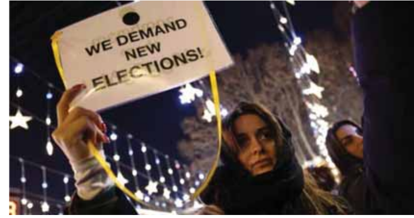
Anti-government demonstrators protest outside parliament Tbilisi on January 1.

"Everything is over for the radical opposition, but everything continues for our country," Kobakhidze stated, emphasizing that the country is on track for sustained growth in various sectors, including the economy. He dismissed the opposition protests, suggesting their influence on the nation's political climate