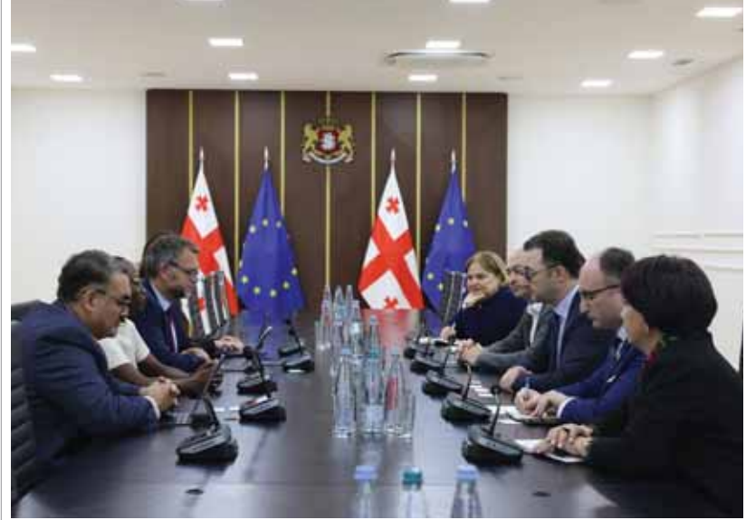
The Ministry of Agriculture and Sustainable Development of Georgia

The seminar was attended by officials from the Georgian Parliament, the Government, the financial sector, analytical centers, research organizations, and academia.