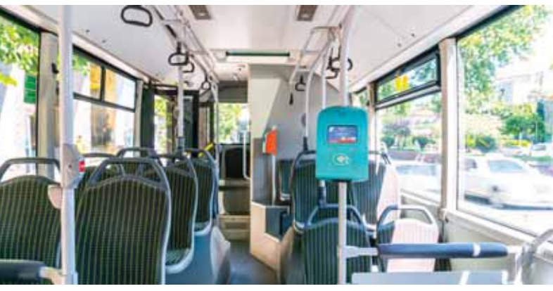
A Tbilisi bus and fare box.

On January 24, one example of just that captured global attention from Georgia, seeing the public transport fare machine system falling victim to a cyberattack. This act, while disruptive, seemed to carry a mischievous tone rather than malicious intent. It's what some might call the work of "green-hat" or "white-hat" hackers, aiming to make a statement rather than cause harm. Interestingly, the renowned hacking group Anonymous later confirmed that Georgian hackers, affiliated with their larger network, had orchestrated the attack. It's a vivid reminder of how interconnected and unpredictable our digital world has become. This wasn't the first time such an incident occurred in Georgia. Just a few months ago, Anonymous claimed responsibility for hacking several government websites, leaving a bold message: "Citizens should not fear their government; instead, the government should fear its citizens." What follows is an exploration of how technology and e-protests have reshaped the way people demand change, through innovation, humor, and a touch of rebellion-a call for change and action. On January 24, the payment machines on Tbilisi's buses and minibuses suddenly started playing some rather unexpected tunes. Passengers woke up to a reality that was as surprising as it was entertaining. While some were understandably concerned, others couldn't