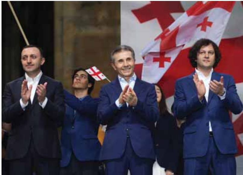
Garibashvili, Ivanishvili and Kobakhidze following their foreign policy speeches in May.

Such a policy requires a rational perception of the regional or global contradictions around us and, as a result of the