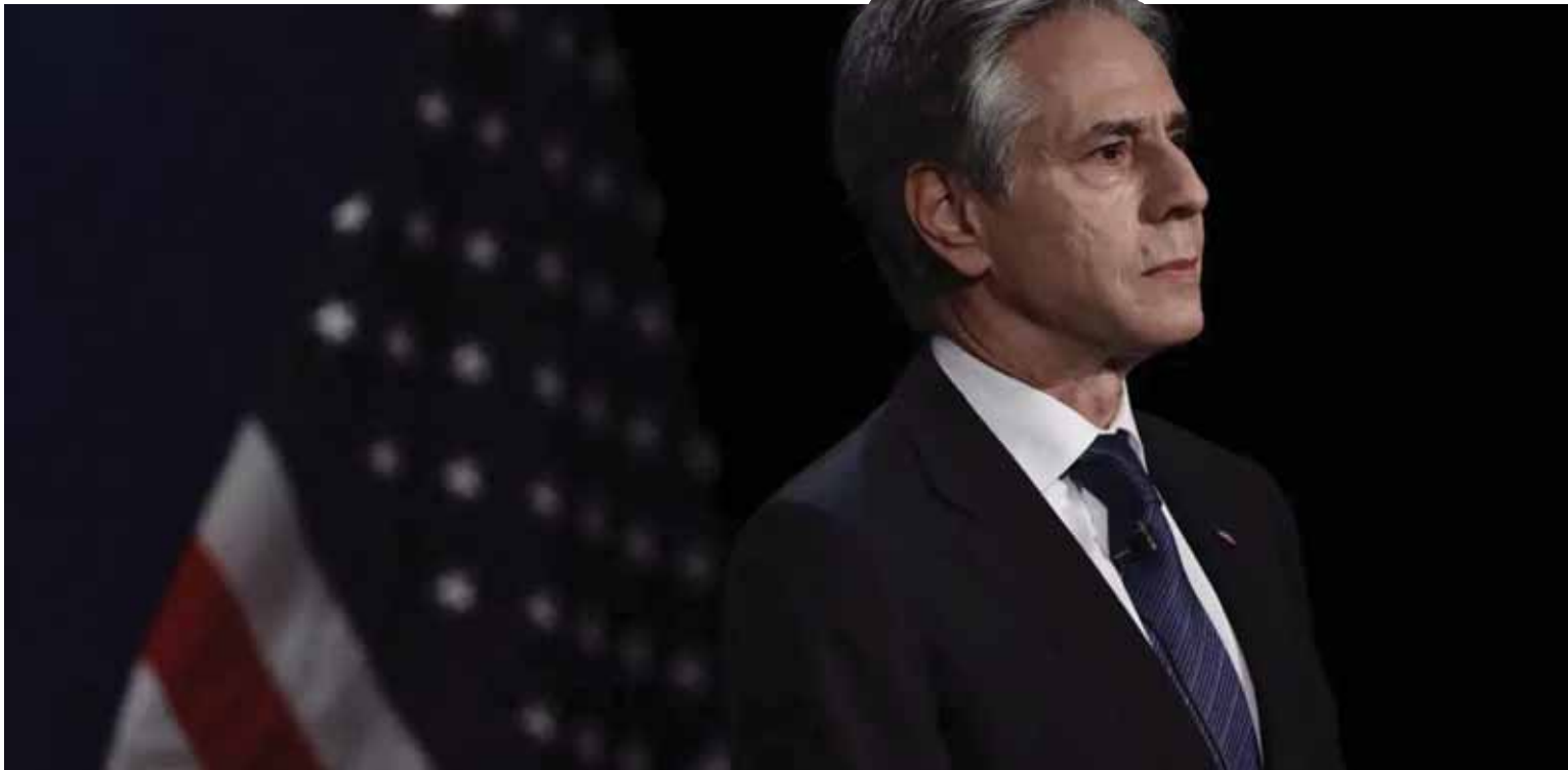
US Congress.