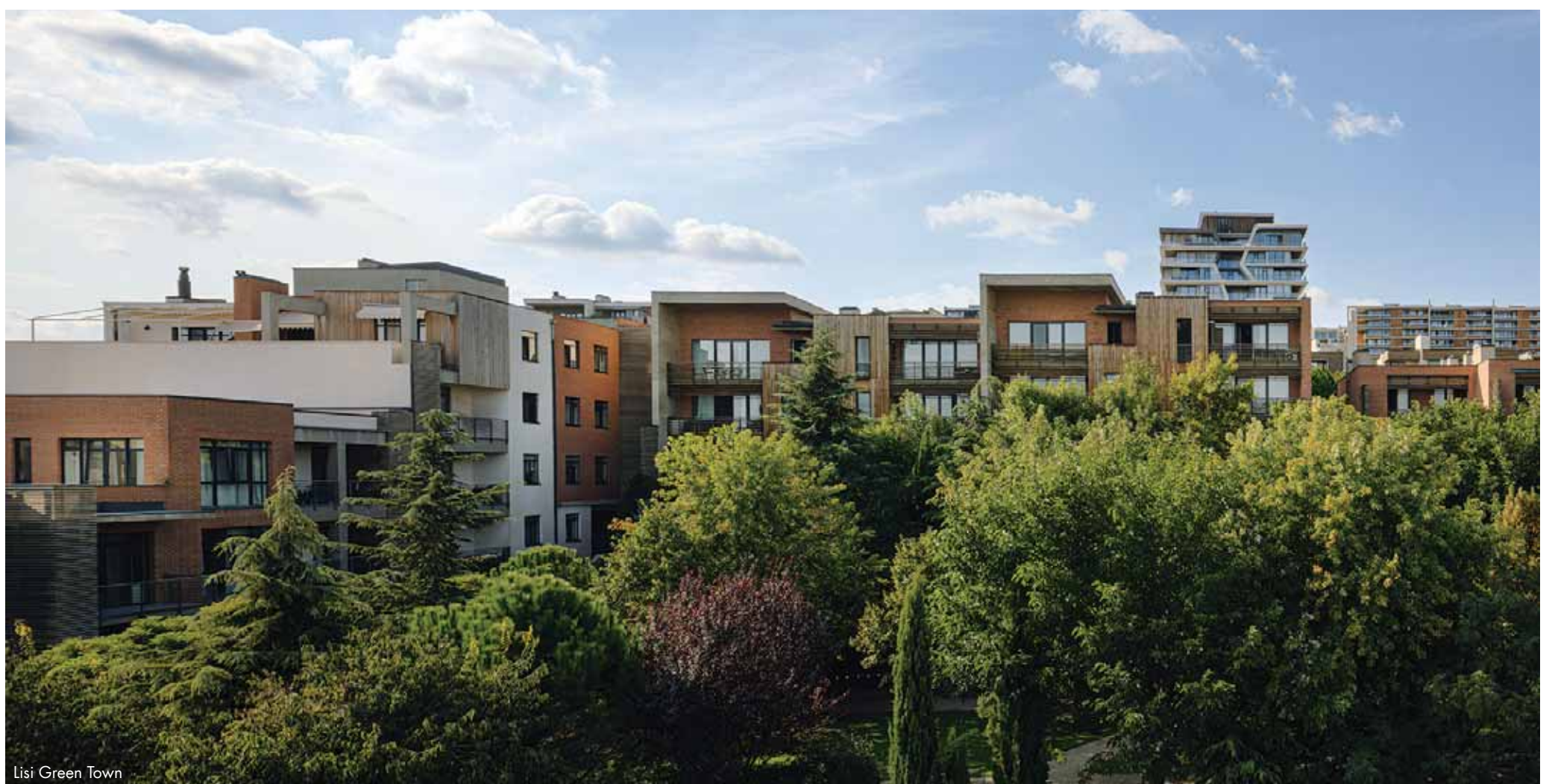
Lisi Green Town