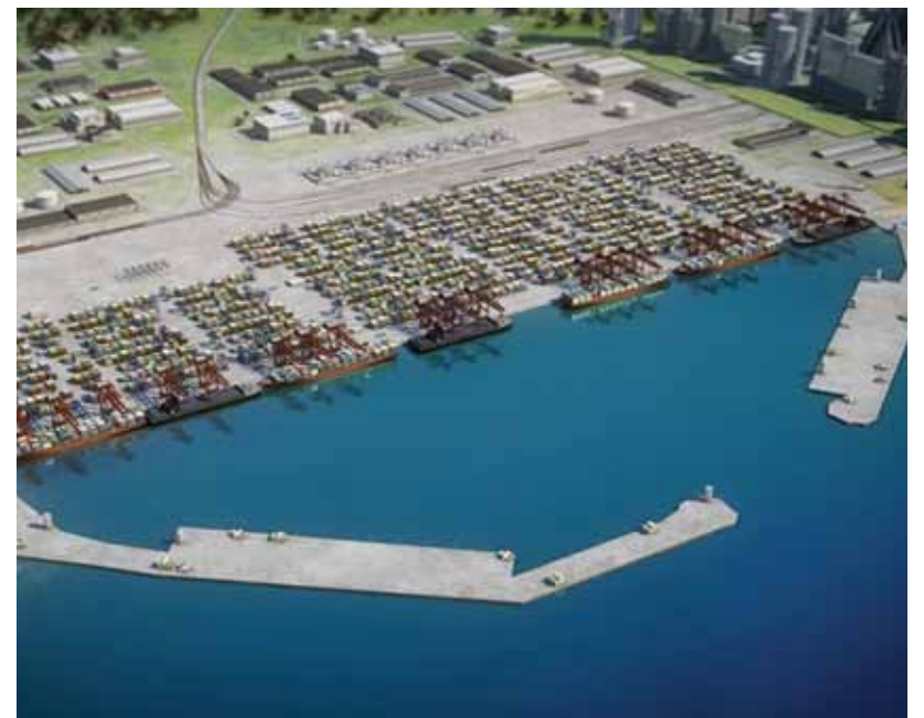
Anaklia Port project.

"The Anaklia Deep Sea Port is a strategic project for Georgia, intended to connect the transport systems of Europe