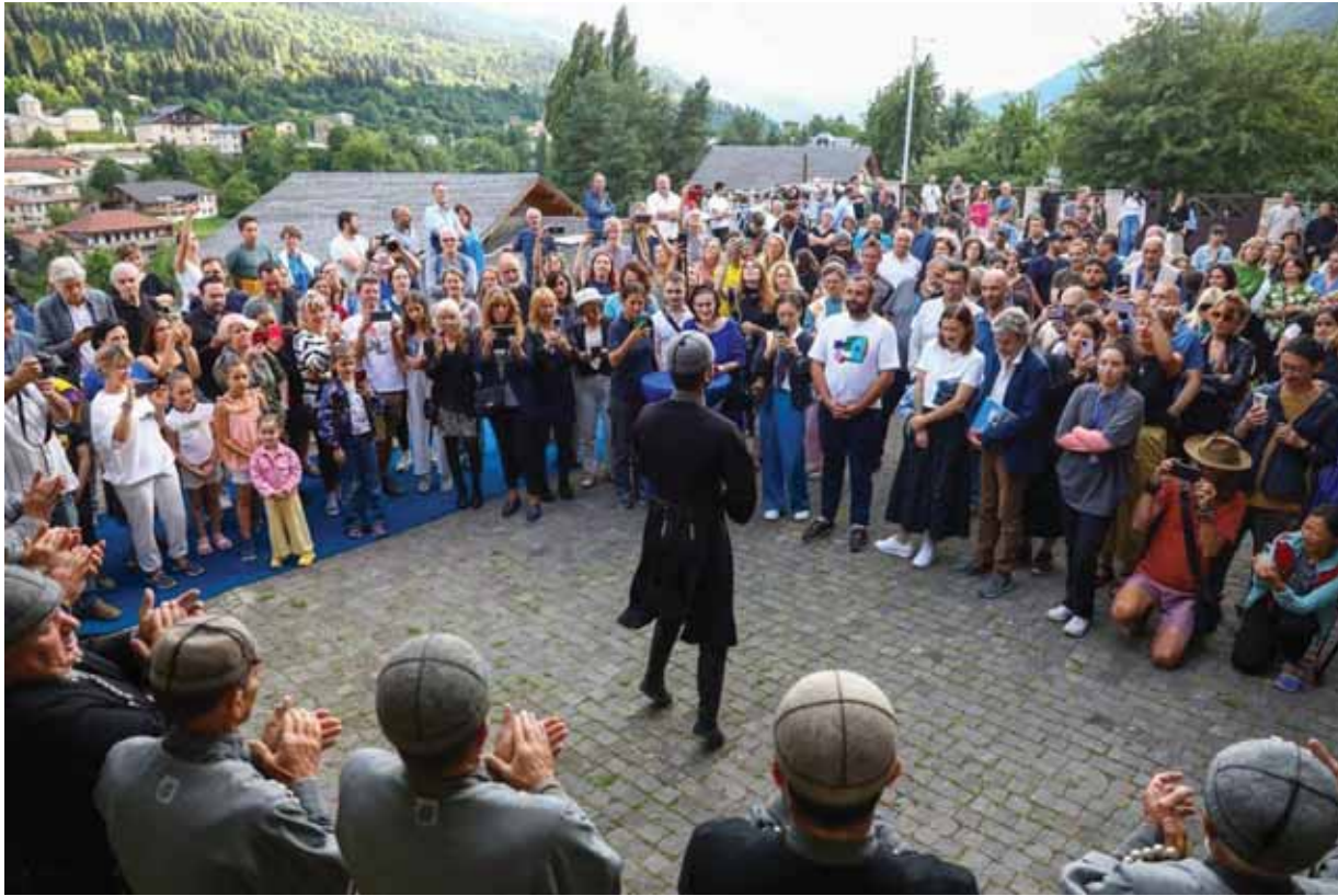
Attendees of Mestiaff enjoying traditional Georgian performances.