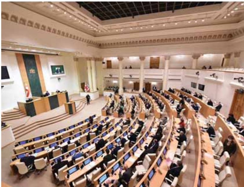
Georgian Parliament.