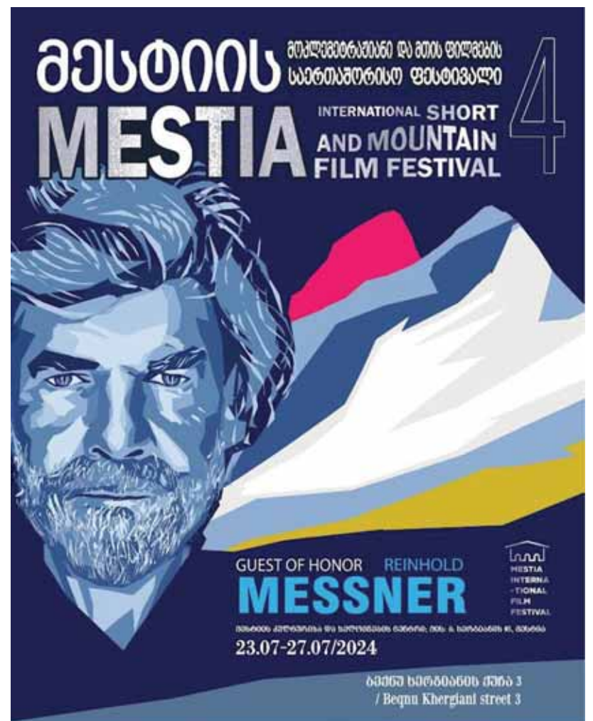
Poster for the Mestia International Short and Mountain Film Festival.