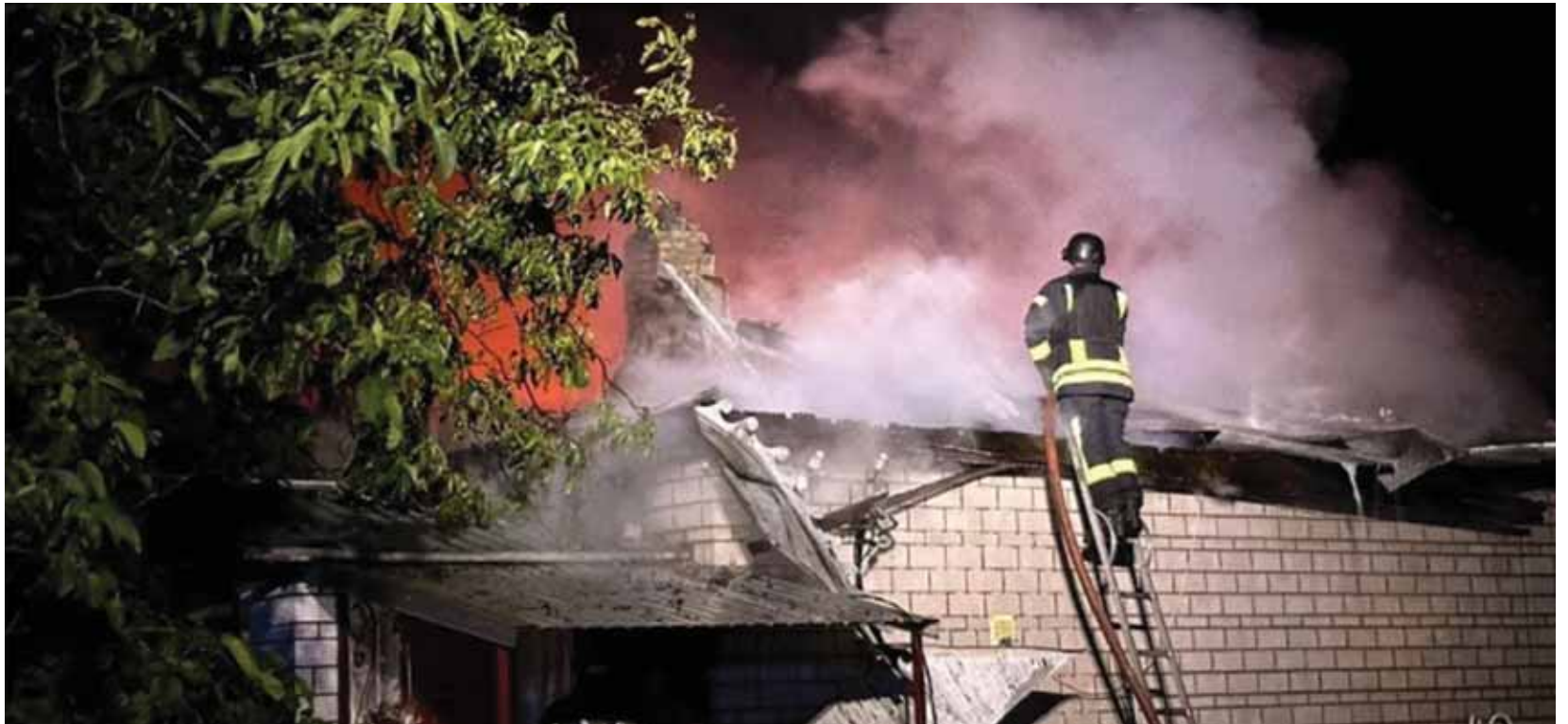
Firefighters work at a site of a residential building damaged during a Russian drone strike.

The military said it was working to assess the damage inflicted from the latest in a series of strikes by Kyiv in that area. Russian air defenses were engaged to counter the attack, but explosions were visible at the target locations.