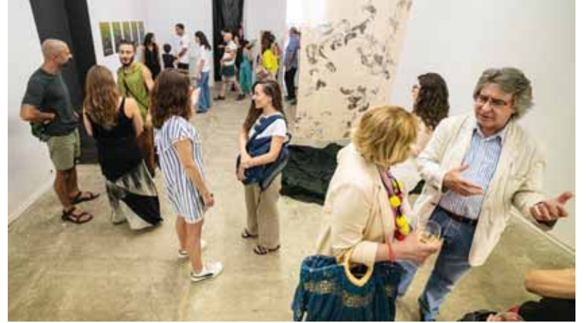
The 'Landscape Tells a Story' exhibition at ArtArea on June 25.