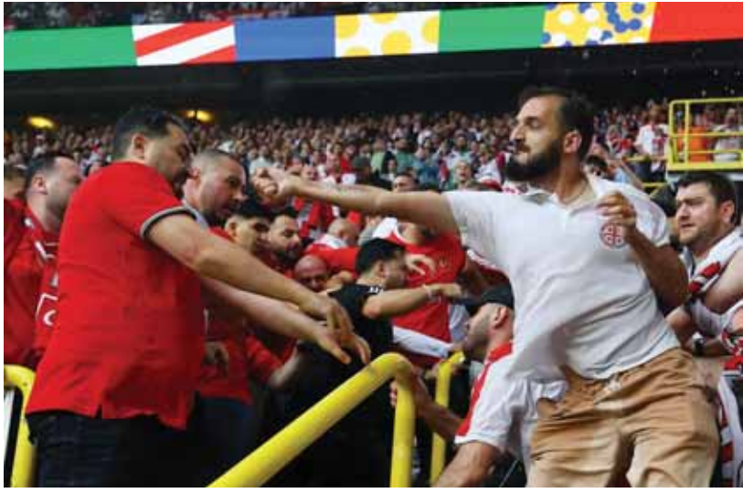
A Georgia fan launches a punch towards a rival supporting Turkey.