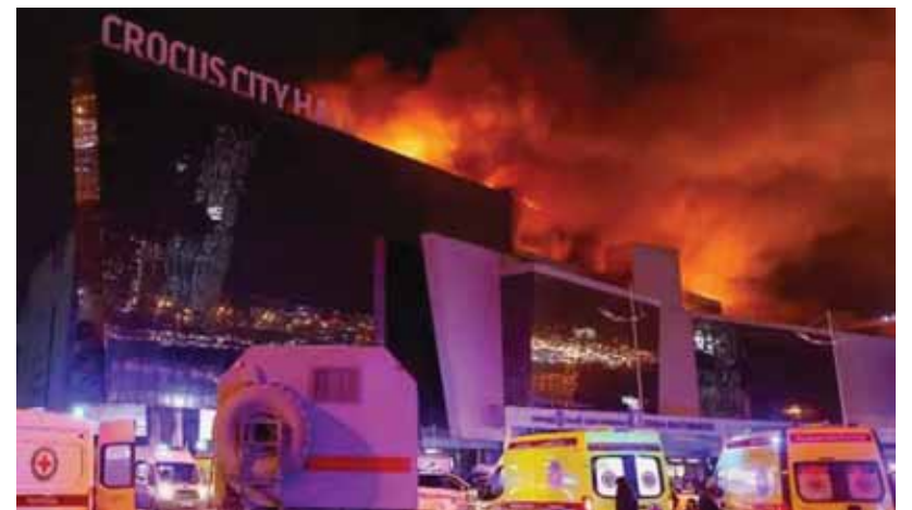
The Crocus attack.

The third deadly terrorist attack that took place in Russia happened less than a fortnight ago in the cities of Derbent and Makhachkala of the Dagestan Autonomous Republic, seeing Islamist terrorists vandalizing and setting a church and synagogue on fire, having murdered a clergyman. As a result of the confrontation between police and the extremist guerillas, the terrorists were annihilated on the spot, but at the same time, 21 other people died too, including policemen and civilians. Surprisingly, a son of a high-ranking Dagestani official was among the terrorists, now arrested, but the fact of his family's complicity is far more mind-boggling