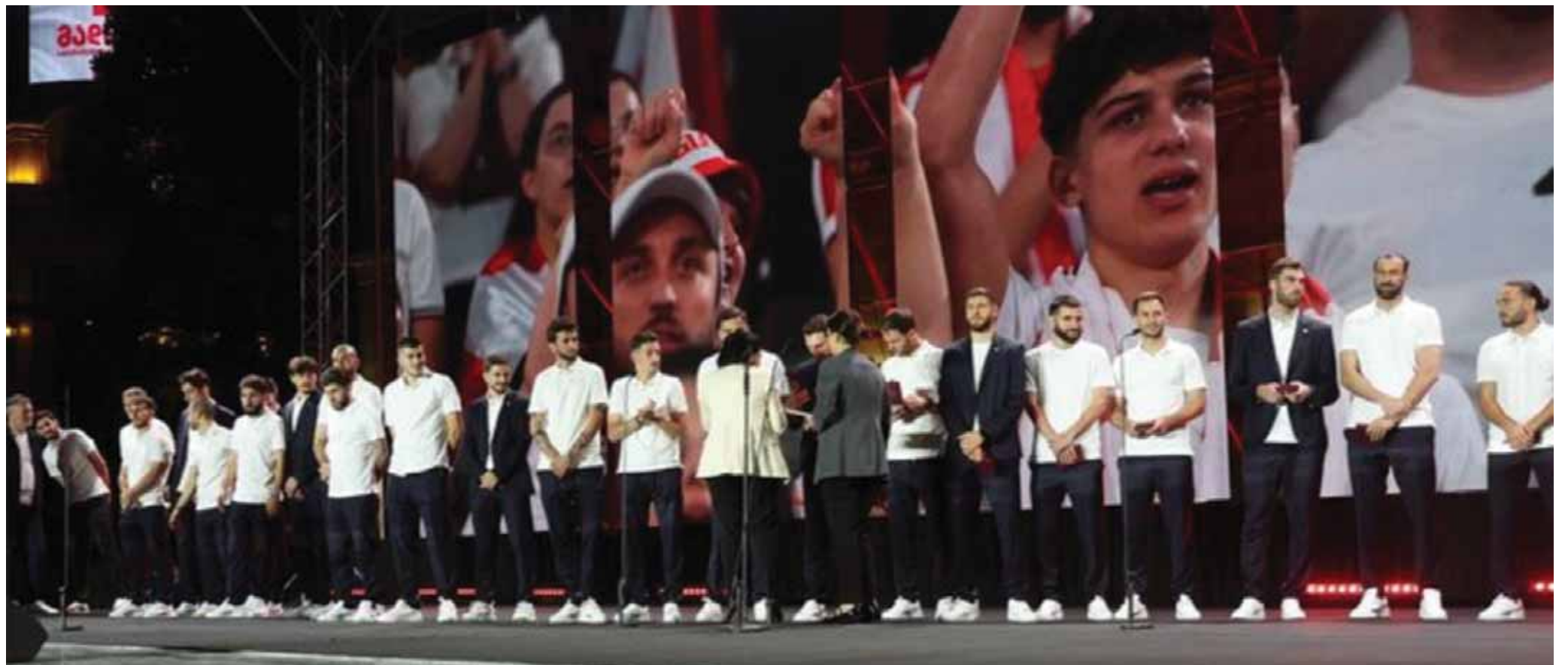
The Georgian national team is welcomed home.

This past week, I have seen the energy of our nation come together. It may seem fleeting right now, but it has the tremendous potential to be turned into a power that makes this country and nation one of the happiest on Earth.