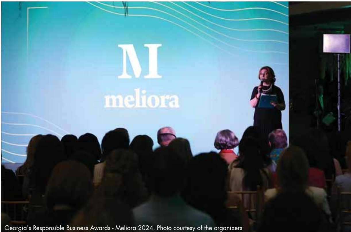
Georgia's Responsible Business Awards - Meliora 2024.