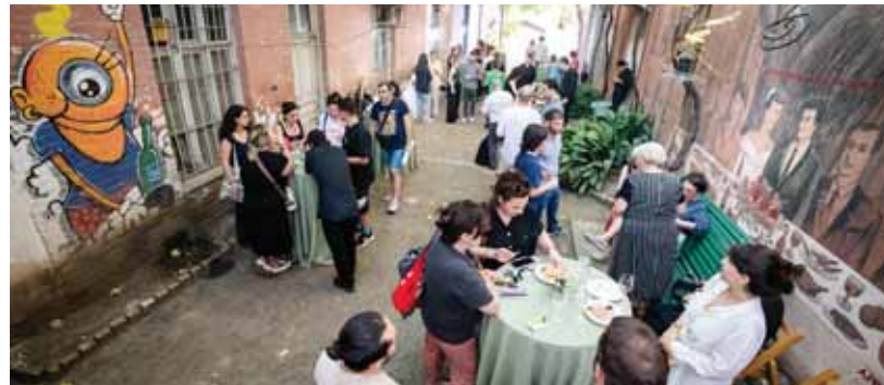
Guests engaging in conversation and refreshments on the opening night of the exhibition.