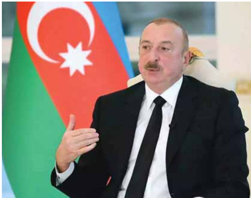
Azerbaijani President Ilham Aliyev.

In the spirit of such a dialogue, members of the Monitoring Committee met with national and local representatives of the ruling party, of the opposition and of civil society.