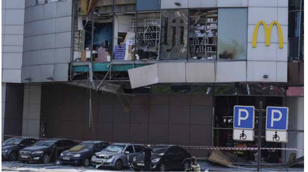
Dnipro after the attack.

Meanwhile, Volodymyr Zelensky's senior aide Andri Yermak said Kyiv was not ready to compromise with Russia and it would never give up any territory seized by Putin's forces since February 2022.