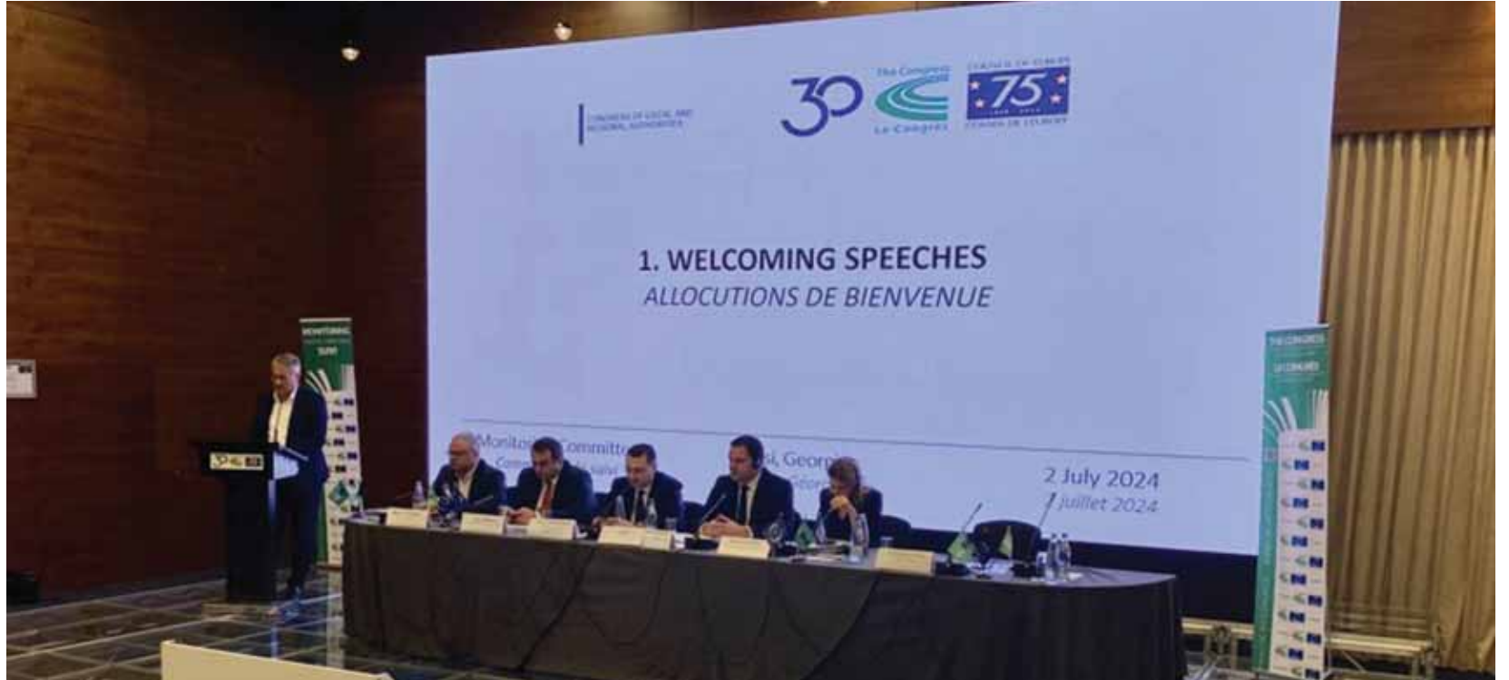
Monitoring Committee of the Council of Europe's Congress of Local and Regional Authorities, meeting in Tbilisi.

porting Georgia's democratic development. The polarization of society and clear signs of democratic backsliding, which undermine democratic stability, compel all political forces in the country to engage in dialogue reflecting the