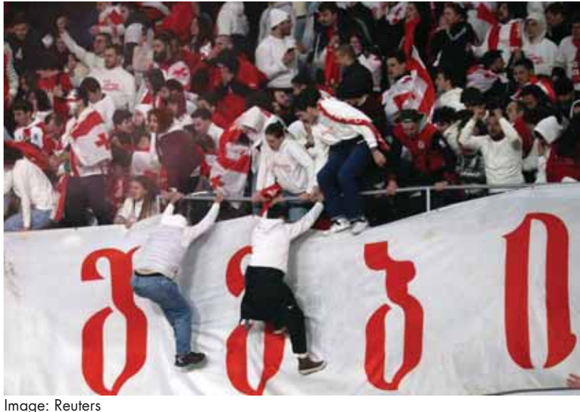
BY ALASTAIR WATT

eorgia entered the unimaginable dreamland of the last 16 of Euro 2024 after a performance for the ages earned them a staggering 2-0 victory over Portugal in Gelsenkirchen on June 26. Exactly three months on from that euphoric triumph against Greece in Tbilisi, the Georgians produced a display that has drawn admiration from all across the football world. The celebratory scenes on the Georgian streets on that famous March night were made to look timid by comparison, as fans partied into the morning all over the country. The feeling of joy and unity was palpable as strangers embraced each other lovingly, car horns tooted incessantly, and even the most reserved Georgians danced jigs of delight, all because of something as simple as a football match.