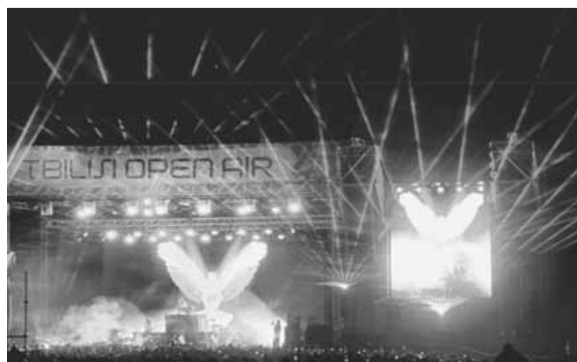
M.I.A. at Tbilisi Open Air 2024

MOKUMOKU, AFTERNOON VERSION, CIRCUS MIRCUS, AND MECHANICAL RAINBOW: GEORGIAN INNOVATION