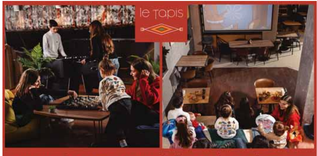
great place for Friends & Family gatherings

In its 40th year, the International Wine Challenge is widely acknowledged as the world's most rigorous, impartial, influential and global wine competition. The International Wine Challenge assesses every wine 'blind' and judges each for its faithfulness to style, region and vintage. Awards include medals (Gold, Silver, Bronze) and Commended awards. Trophies are awarded to the very best wines in each category. The International Wine Challenge is committed to helping consumers discover great wine, and the medals displayed on winning bottles offer a trusted guarantee of quality.