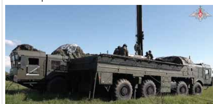
Russian service members at an unknown location in Russia's southern military district.