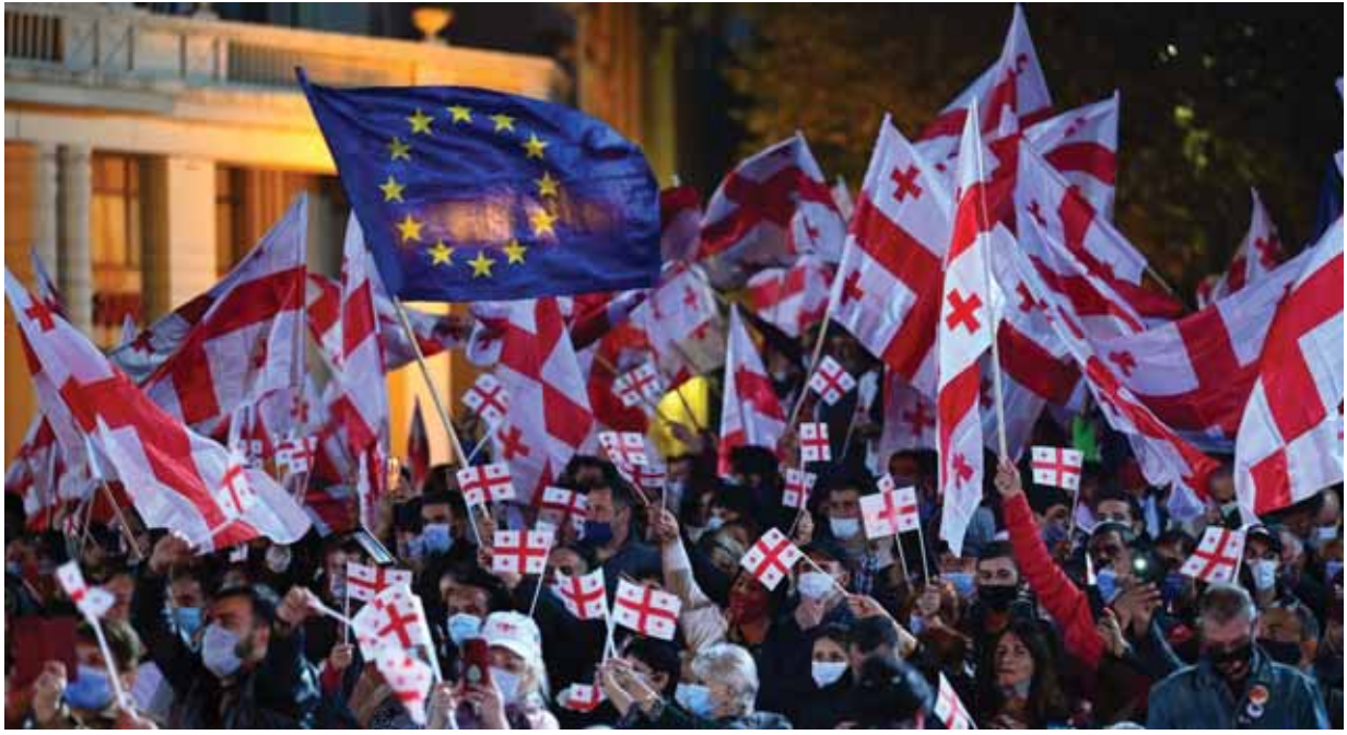
Everyday people in the streets are clamoring for their voices to be acknowledged.

These assailants had been dispatched by a man named Fulbert, the enraged uncle of Heloise d'Afgenteuil, the beautiful and now pregnant love of Peter's life.