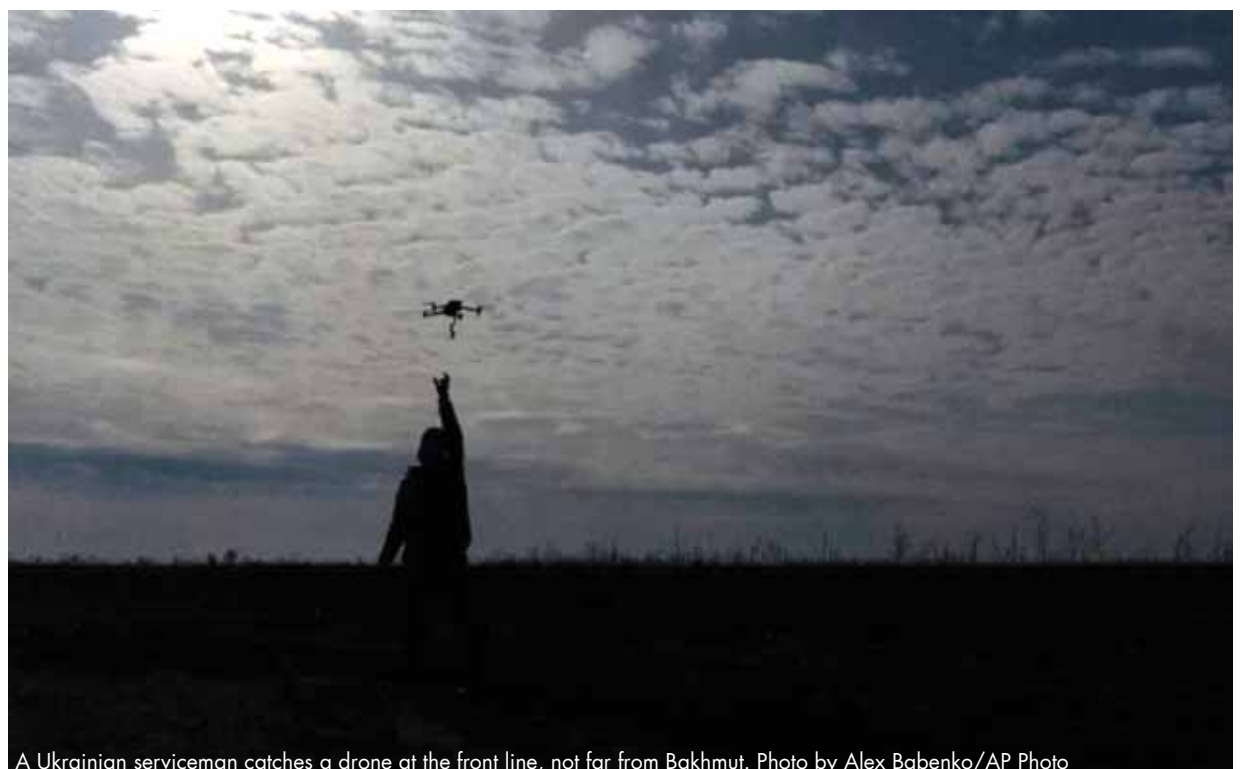
A Ukrainian serviceman catches a drone at the front line, not far from Bakhmut.