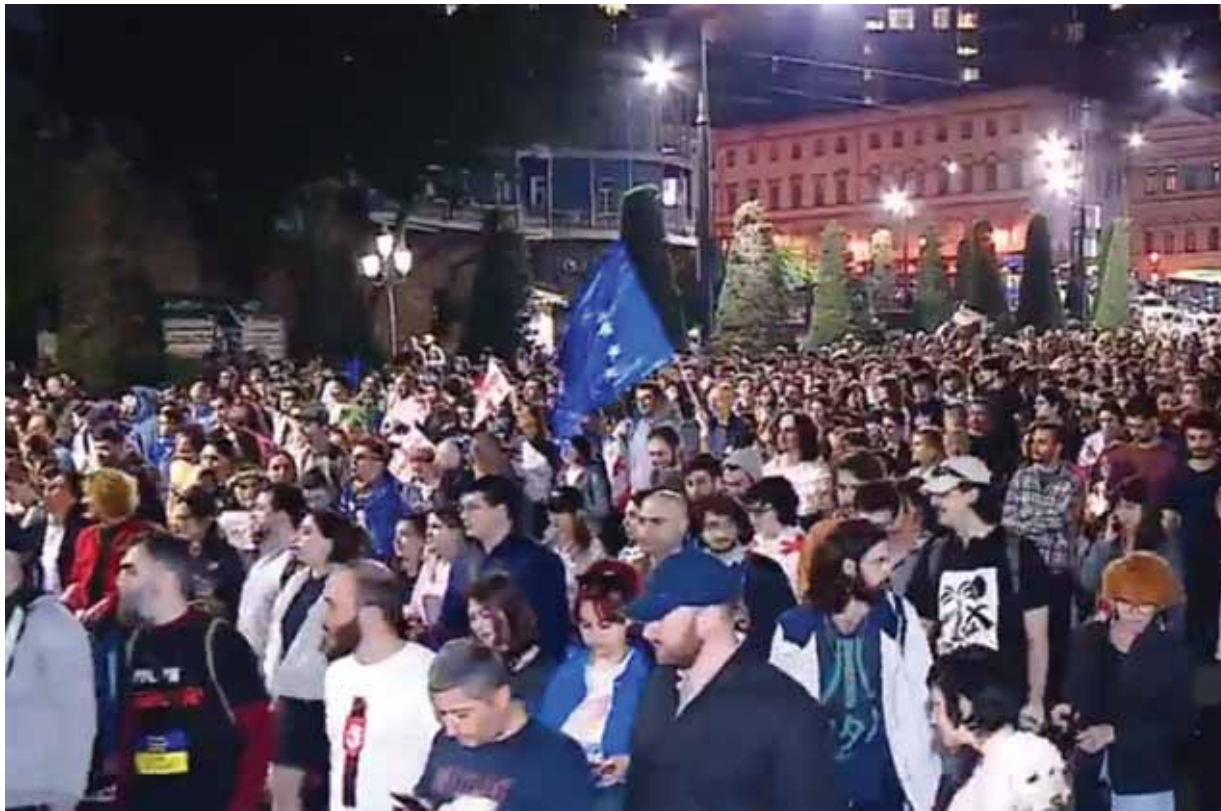
Georgia's youth protest the government's decision to introduce the foreign agents bill.

Questions abound as to what will happen on April 29, when Georgian Dream gathers its own supporters in front of Parliament. Part of the current protesters aim to respect the "others" right to protest; some say there may be confrontations as emotions run high. It is also suspected that Georgian Dream will be bussing in its state-employees from across the country, of which there are over 100,000, leading to accusations of coercion. Indeed, such moves have been evidenced in past cases by both the current and previous governments of Georgia.