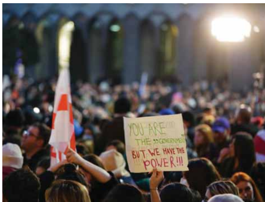
Georgia's youth protest the government's decision to introduce the foreign agents bill.