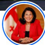
სალომე ზურაბიშვილი / Salome Zourabichvili 175K followers + 3 following

The President of Georgia vetoed the laws passed by Parliament that aimed to eliminate gender quotas.