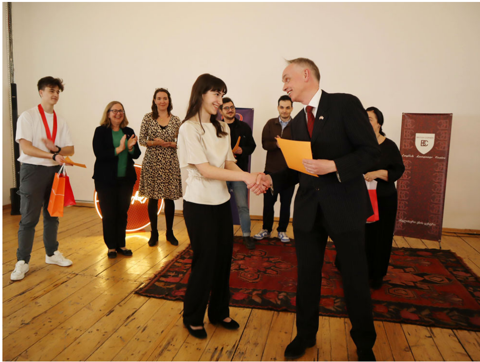
The Runner-up-Nini Gaprindashvili