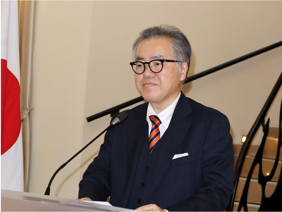
H.E. ISHIZUKA Hideki

GGP Program, totaling over 20 million USD, in addition to other grant schemes. The GGP program aims to support human security in Georgia in the following priority fields: environment protection, agriculture, infrastructure, healthcare, social care and education.