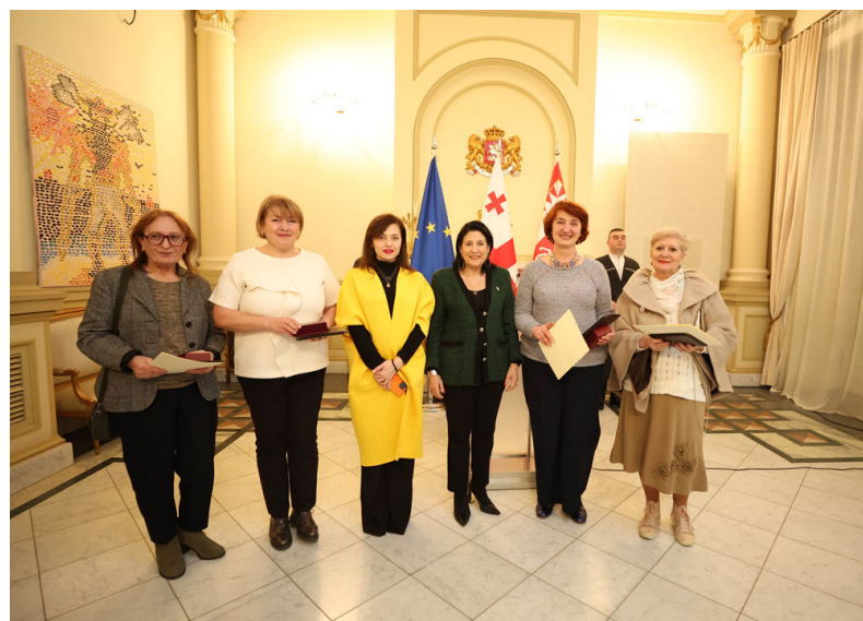
Salome Zourabichvili, the President of Georgia, awarded medals of honor to five female human rights defenders on the occasion of International Women’s Day, according to the administration of the President of Georgia.

According to the President’s administration, Zourabichvili