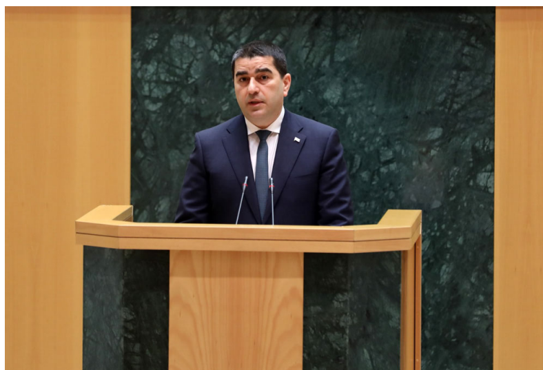
Parliament Chairman Shalva Papuashvili, while presenting the one-year work report to the Parliament, stated that the North Atlantic Alliance should follow the European Union's example and provide clear criteria for Georgia's accession, as the European Union has done.

"Georgia is not competing with anyone on the way to the