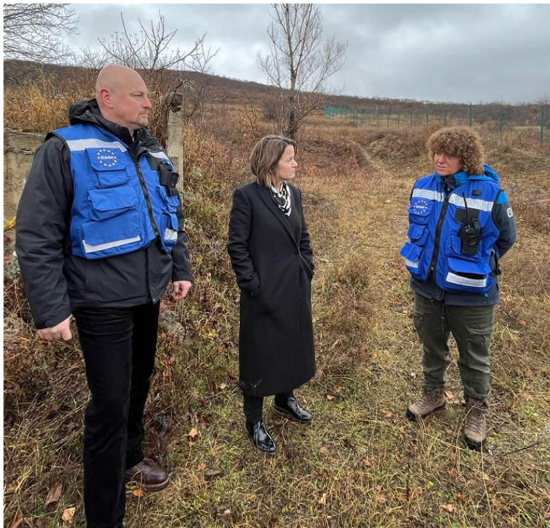
PREPARED BY MESSENGER STAFF