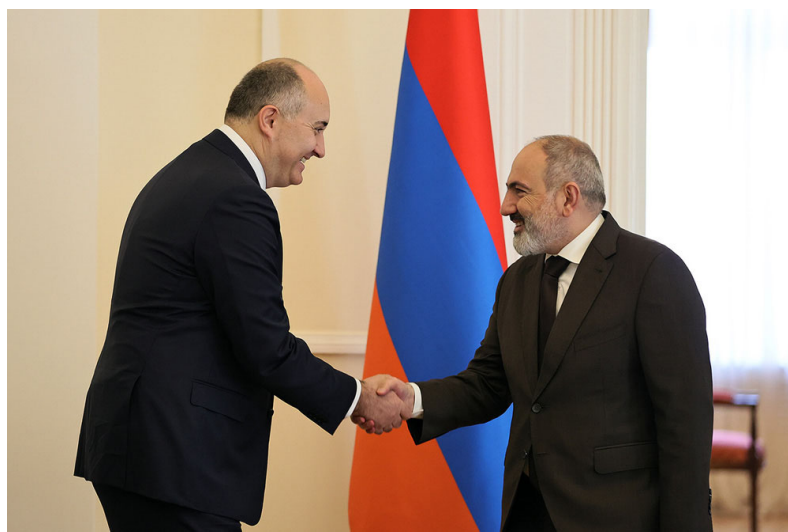
During his visit to the Republic of Armenia, Georgian Defense Minister Juansher Burchuladze

met with Armenian Prime Minister Nikol Pashinyan. According to the information from the Ministry of Defense of Georgia, the parties discussed the security environment and challenges in the region and the world.