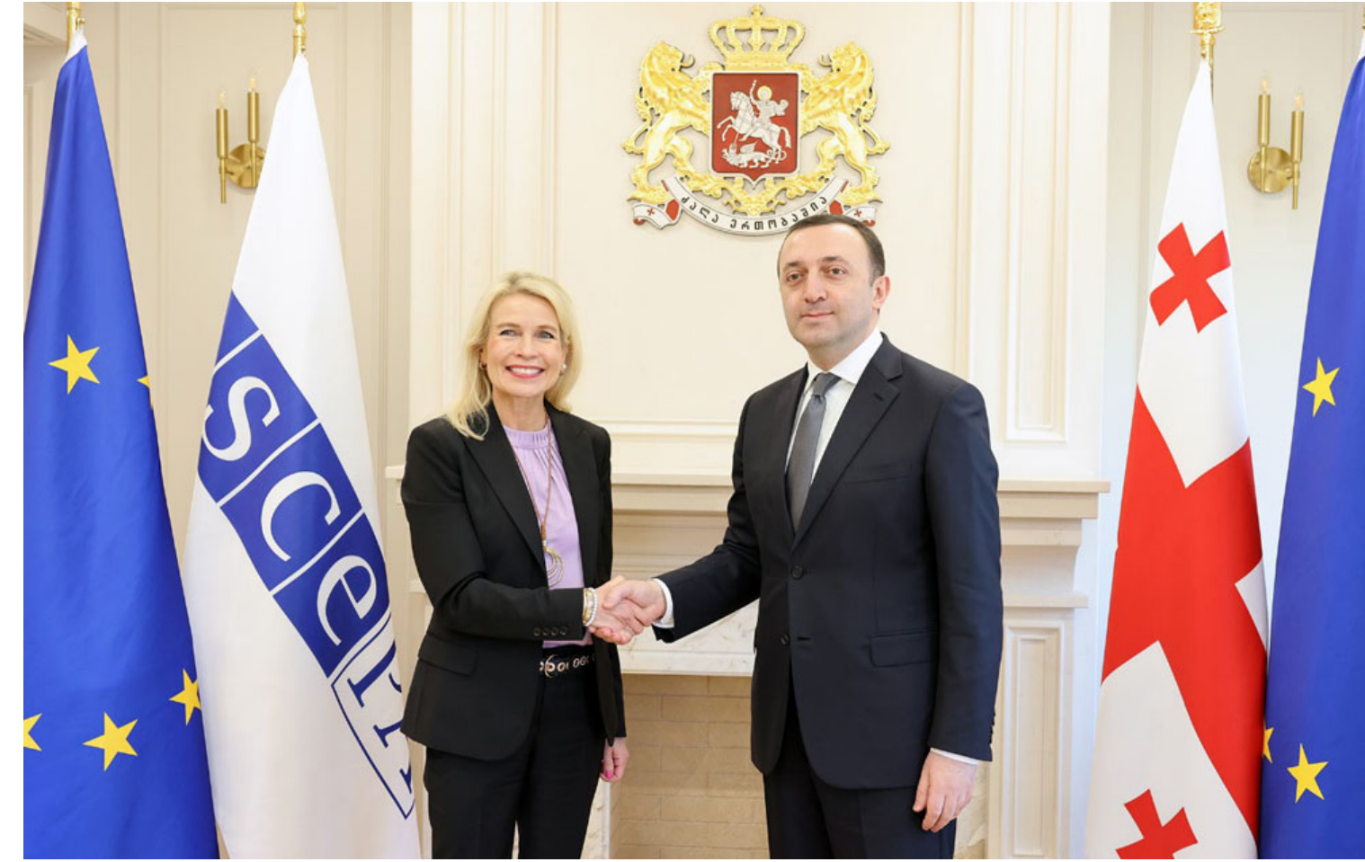
steps to enhance communication between neighbors and promote stability within the region. The country remains committed to solidifying peace and stability in

The meeting also addressed the current situation in the region. As the Prime Minister noted, Georgia has already taken