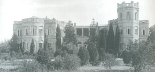
THE CASTLE OF THE PRINCE IVANE MUKHRANBATONI