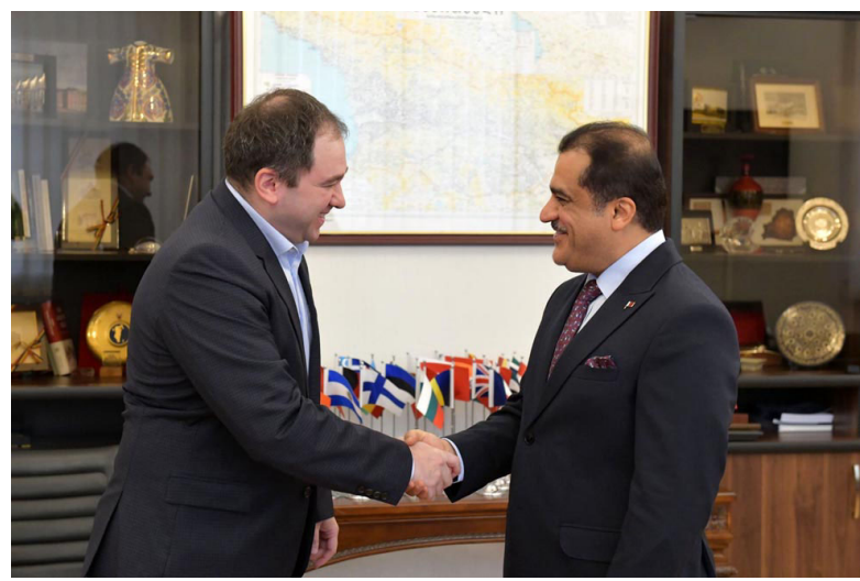
"At the meeting with the ambassador of Qatar, we mentioned that the political relations be-