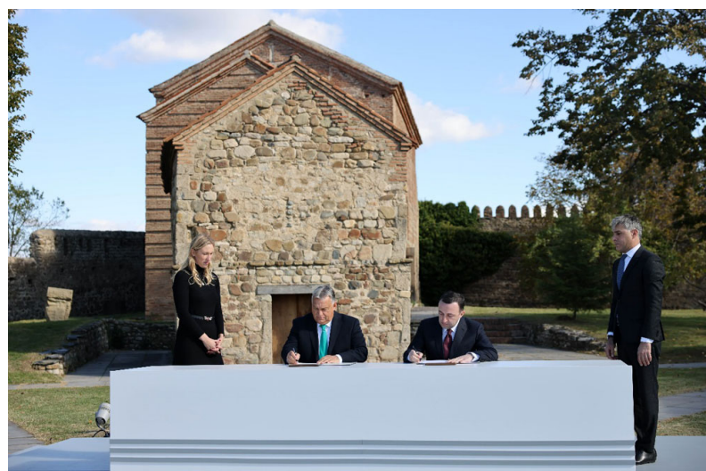
The joint intergovernmental commission of Georgia-Hungary, led by Irakli Gharibashvili, con-

vened a session during which ten documents were signed, including the "Joint Declaration between Georgia and Hungary." The Prime Minister of Georgia, Irakli Gharibashvili, signed the document on behalf of Georgia, while the Prime Minister of