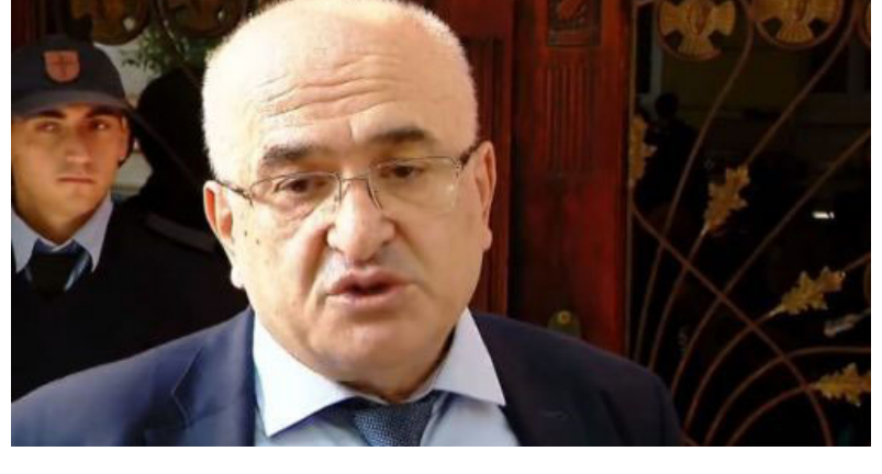
The Constitutional Court has cians express their opinions pre-