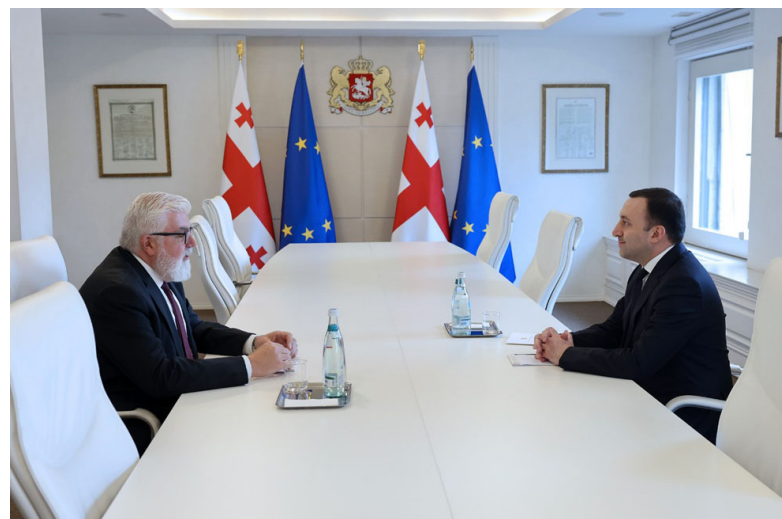
two countries and wished him success in his future endeavors,"

"During the conversation, they discussed important projects aimed at supporting the country, with a particular emphasis on Slovakia's assistance to the health sector. The meeting took place at the government administration, where the Ambassador of the Slovak Republic affirmed his strong support for Georgia's EU membership. Prime Minister Irakli Gharibashvili expressed gratitude to the Ambassador of the Slovak Republic for further strengthening the existing strategic partnership between the