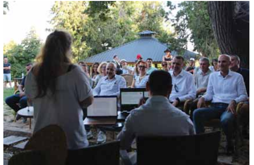
Assessing a year of achievements

There are hundreds if not thousands of beautiful and important locations within each of Georgia's regions that would benefit from SADAGI's efforts, and tens of thousands of Georgians who care so much about their neighborhoods that they could easily become pro-active SADAGI guardians of our clean environment. Enough Georgians believe in the