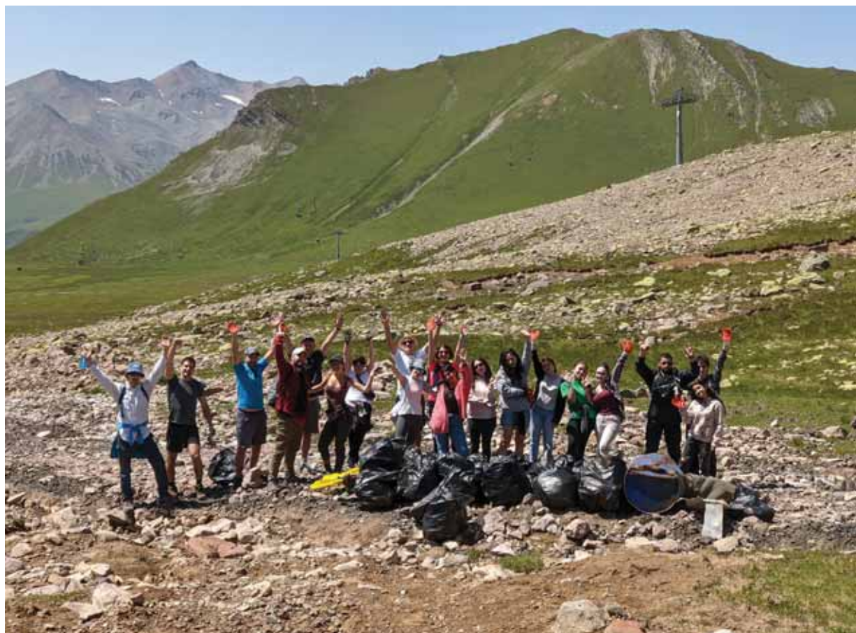
One of Sadagi's many clean-ups in Georgia