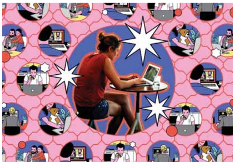
Illustration by Samar Haddad/The Verge.

Clearly and notably, a considerable chunk of the aggregate national time in Sakartvelo seems to be relentlessly wasted on several models of public conduct: The widest possible interaction of hundreds of thousands of our citizens within the framework of various social media, including Facebook, Instagram, Twitter, WhatsApp, Messenger, TikTok, Viber,