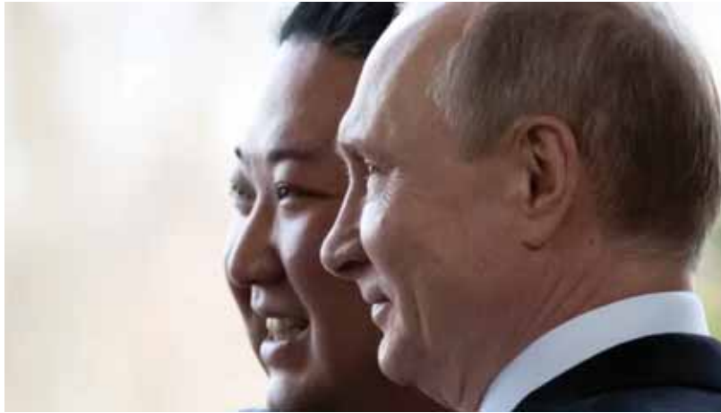
Russian President Vladimir Putin and North Korean leader Kim Jong Un held talks in 2019.

"I would like to reaffirm our principled position: we will be ready to consider the possibility of reviving the 'grain deal' ... and we will do this immediately — as soon as all the agreements on lifting restrictions recorded in it are fully imple-