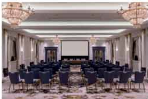
Marriott Grand Ball Room