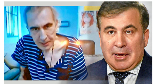
Concerns have been raised over Mikheil Saakashvili's health since his detention, with his appearance substantially altered