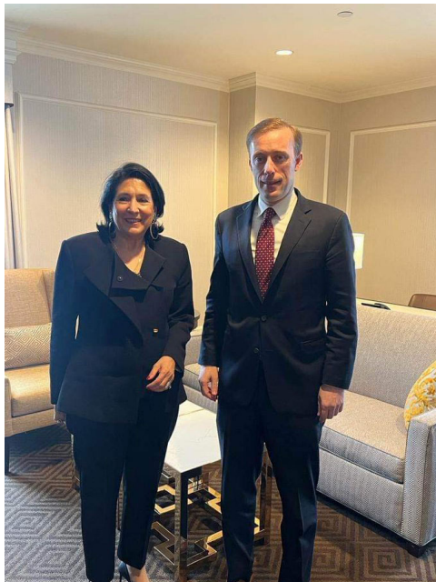
The President of Georgia Salome Zourabichvili met with the National Security Adviser to Joe Biden Jake Sullivan. According to the press release,

they talked about recent developments in Georgia and emphasized the common interest of the two countries in Georgia's Euro-Atlantic integration.