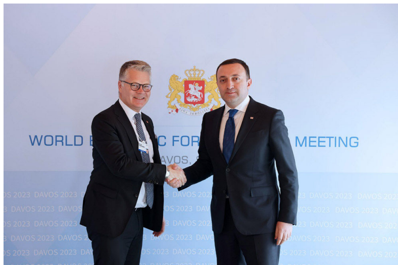
The Prime Minister of Georgia, Irakli Gharibashvili, met

Prime Minister of Georgia, Irakli Gharibashvili, meets with CEO of the Swedish shipping line company Stena Line