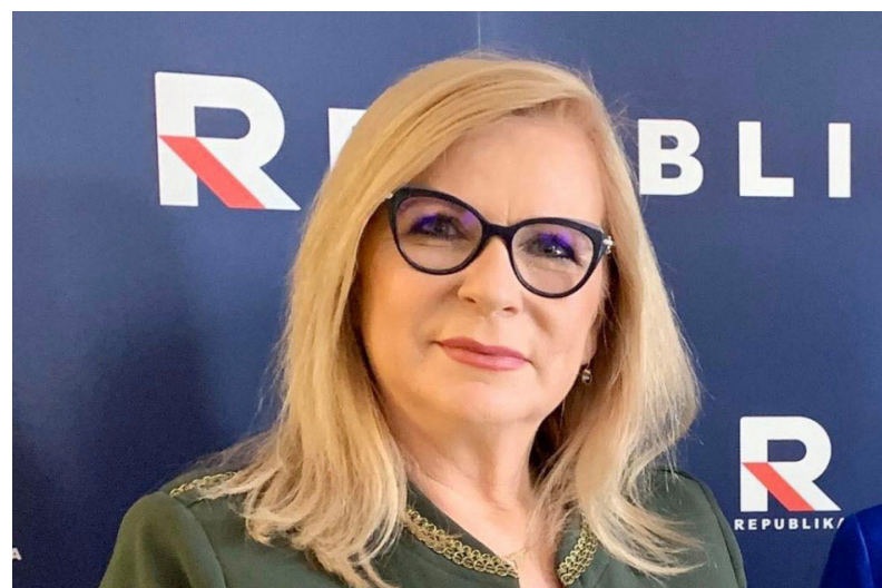
Deputy Speaker of the Polish Sejm, Ma 3 gorzata Gosiewska

calism is important, and the main key to this lies in weakening the radical part of the opposition, which should be supported by everyone who is interested in the development of our country," Kobakhidze said.