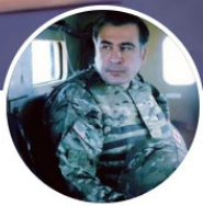
Mikheil Saakashvili 1.3M followers • 0 following