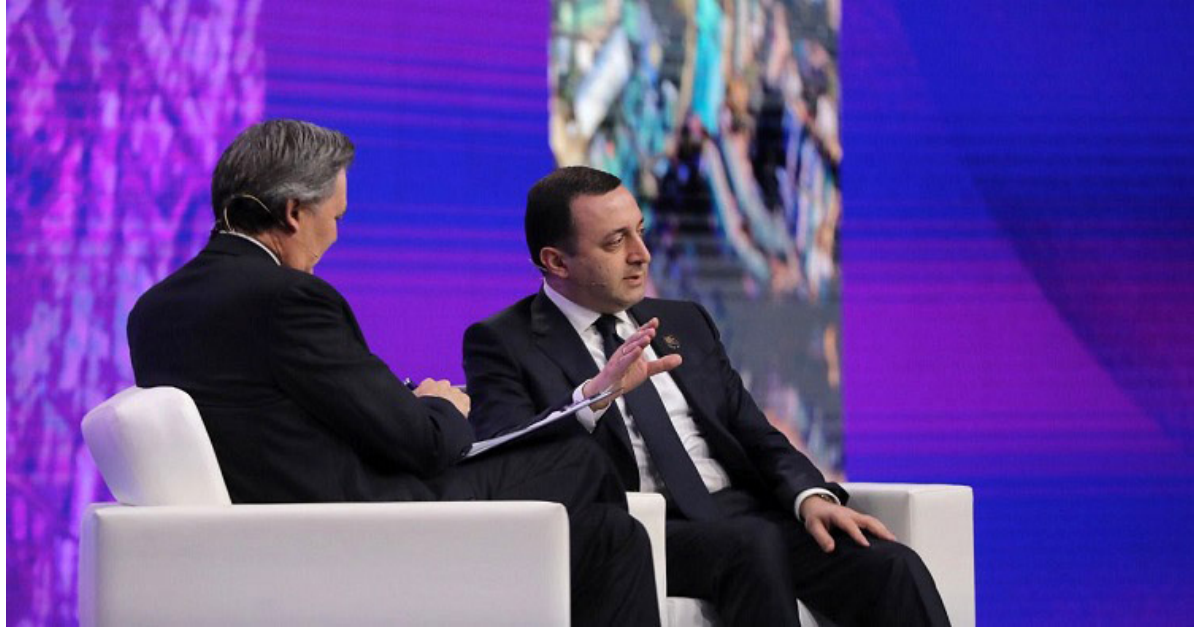
"We cannot impose sanctions [on Russia] for natural reasons because we have national interests, Georgian Prime Minister Irakli Garibashvili said.