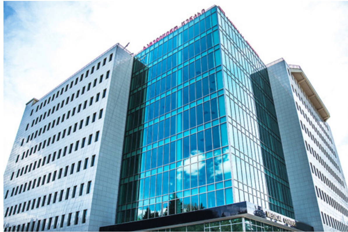
examinations (including magnetic resonance imaging).

In order to avoid possible complications due to insufficient food intake, the patient continues laboratory monitoring, is consulted by a specialist doctor of various profiles and has conducted numerous instrumental