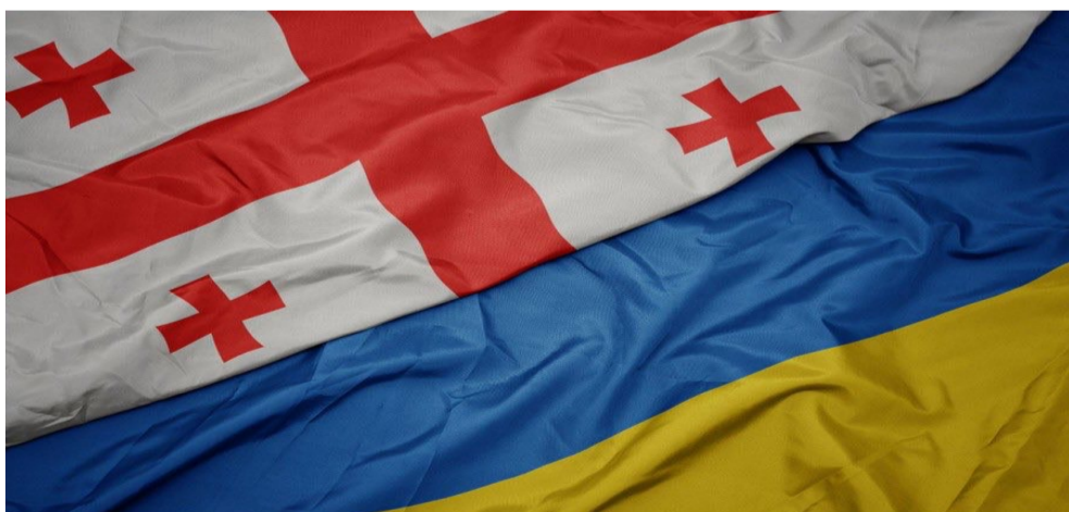
► The two officials also discussed specific areas of their activities during the online meeting to enhance future cooperation between the law enforcement agencies of Georgia and Ukraine.

According to the European Union, Europe will be independent of Russian energy until 2030. According to Berbock, Germany has already rejected the North Stream 2 pipeline project.