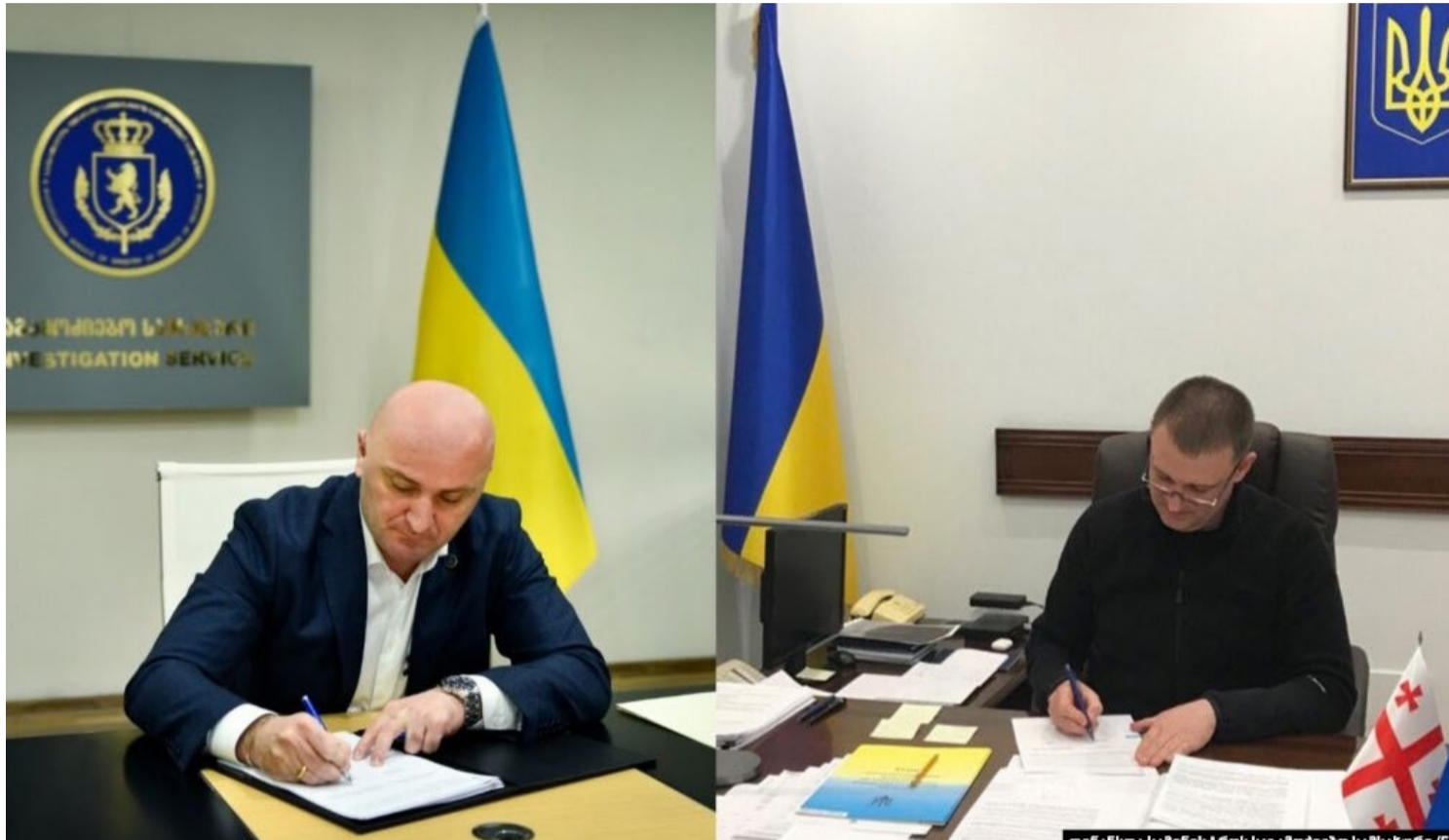
► The memorandum focuses on bilateral cooperation between the sides in detecting, preventing, and investigating crimes committed in the financial and economic fields.