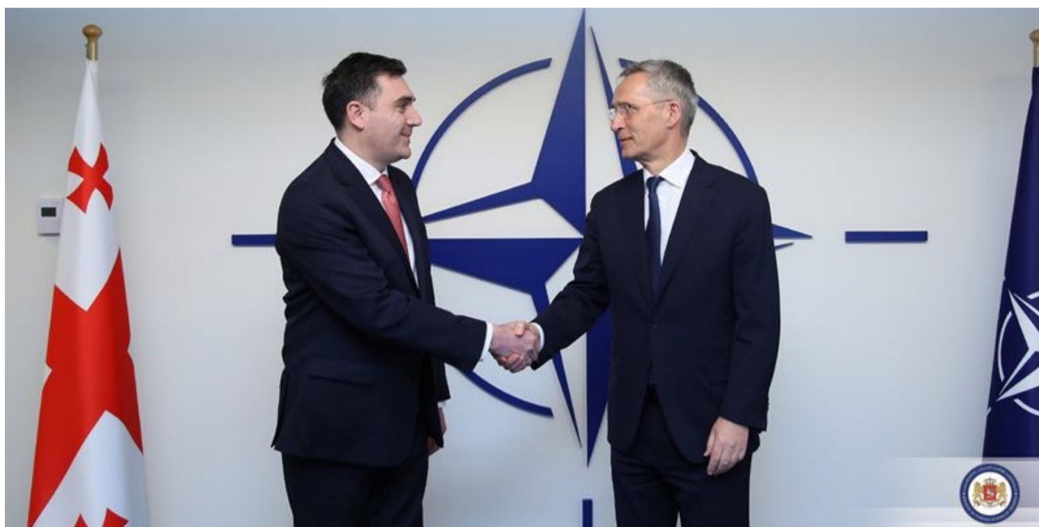
► Georgian Minister of Foreign Affairs Ilia Darchiashvili and NATO Secretary-General Jens Stoltenberg.

According to the statement of the Georgian Foreign Ministry, the sides exchanged