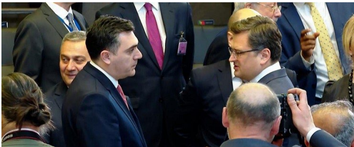
► Georgian Minister of Foreign Affairs Ilia Darchiashvili and Ukrainian Foreign Minister Dmytro Kuleba at the NATO Ministerial.

views on the security environment in the region and reaffirmed their readiness to cooperate actively in the future. NATO's firm support toward Georgia and its Euro-Atlantic integration was also stressed.