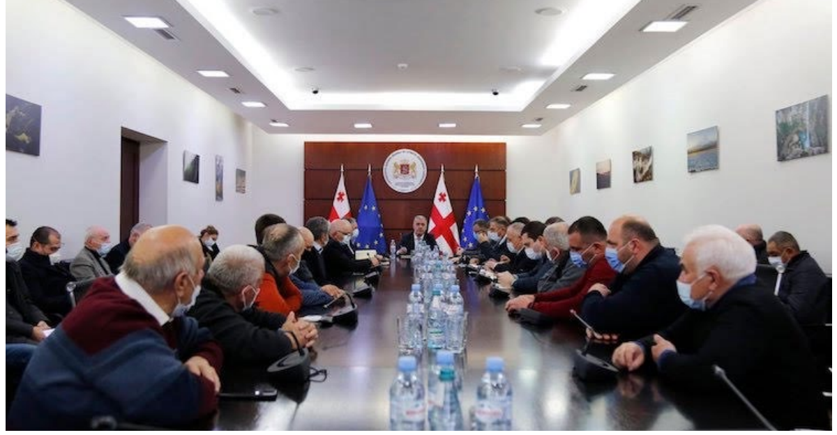
▶ As decided at the meeting with farmers, the relevant structures of the Agriculture ministry will start working on developing proposals and support mechanisms to tackle issues in the sector.