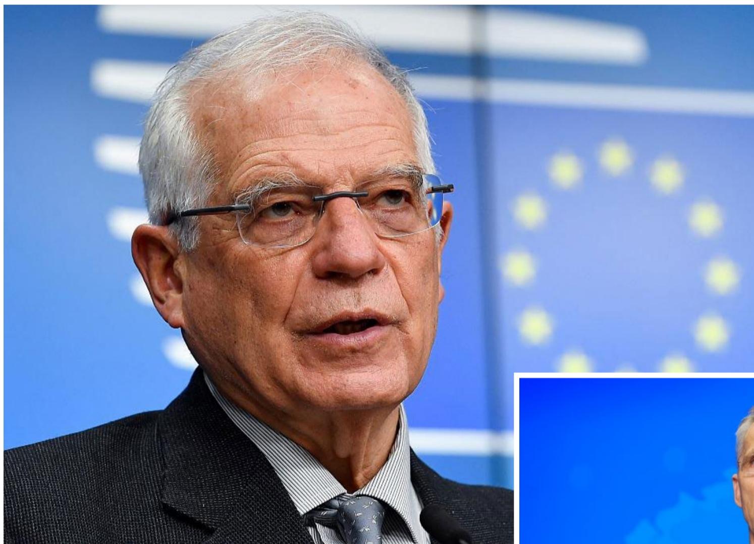
► High Representative Borrell reaffirmed the EU's unwavering commitment to Georgia's territorial integrity and sovereignty within its internationally recognized borders.