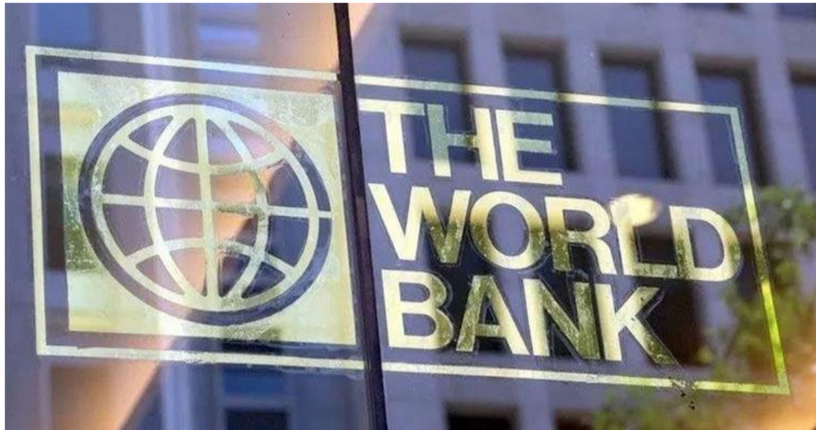
► For the first time Georgia will be applying a PforR instrument for World Bank financing for any sector.