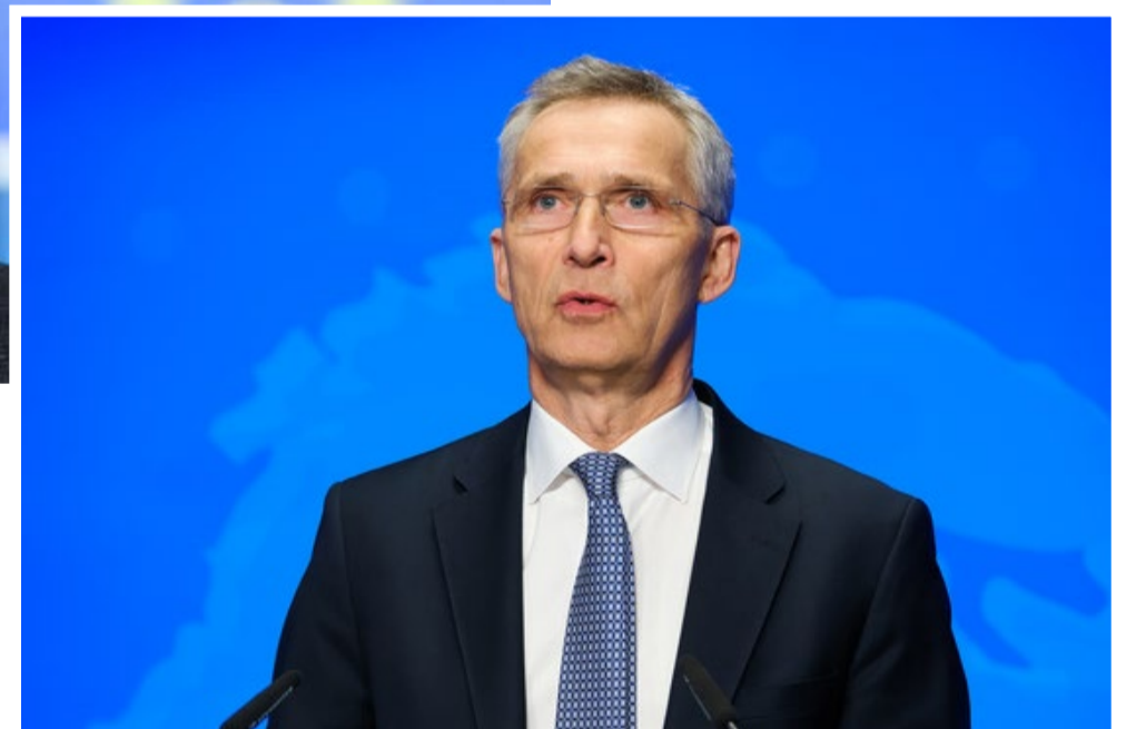
► "I also expect we will agree to step up a tailored support for other partners at risk from a Russian pressure including Georgia and Bosnia-Herzegovina," NATO Secretary-General said.

Yesterday NATO Secretary-General, Jens Stoltenberg talked about stepping up support for NATO partners which are at the risk from Russian aggression. Stoltenberg stated at a news briefing ahead of the NATO Summit on the crisis in Ukraine that NATO, together with the European Union, must help Georgia and Bosnia-Herzegovina to uphold the sovereignty and the right to make independent decisions.