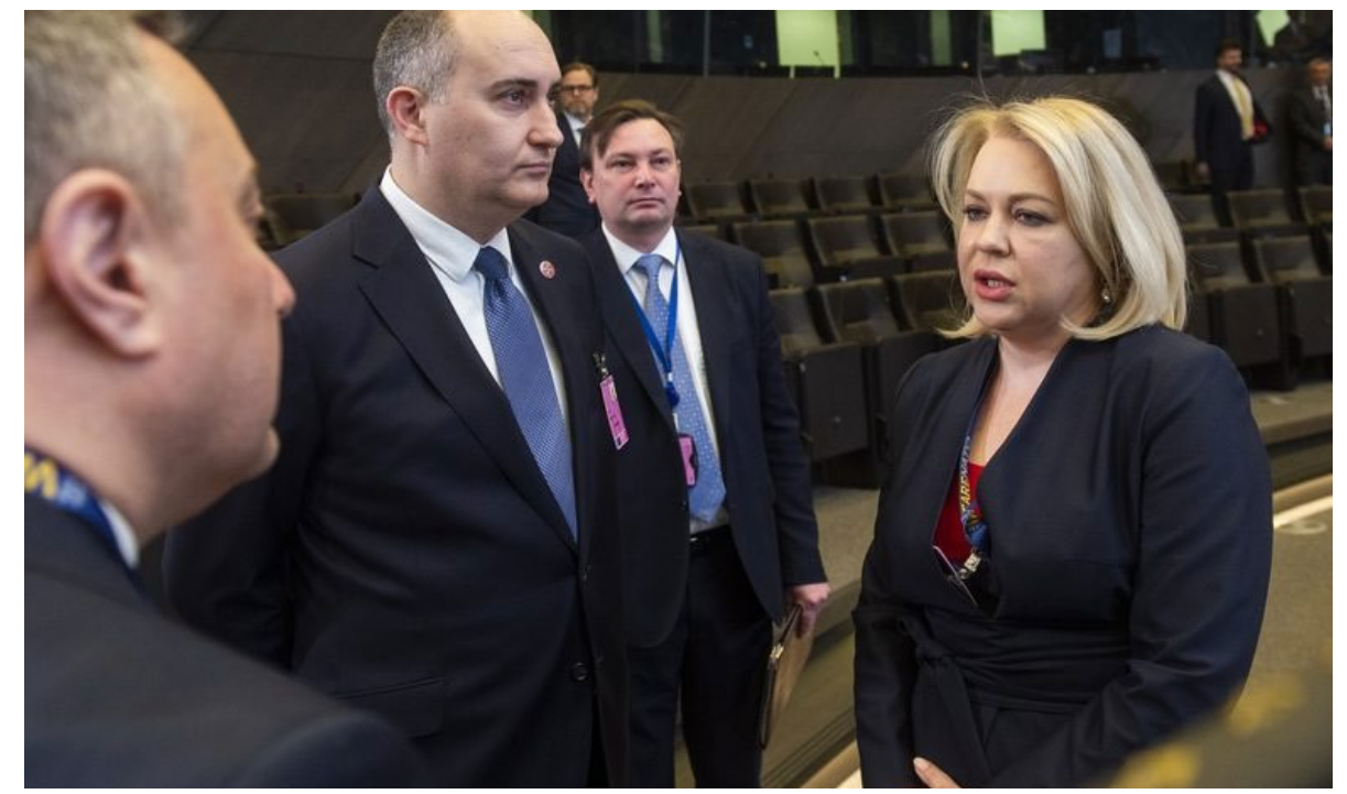
> The Minister of Defense of Georgia Juansher Burchuladze pays a visit to Brussels.

"The issue of Georgia has never been so topical in NATO before," Burchuladze said, noting that each Minister took note