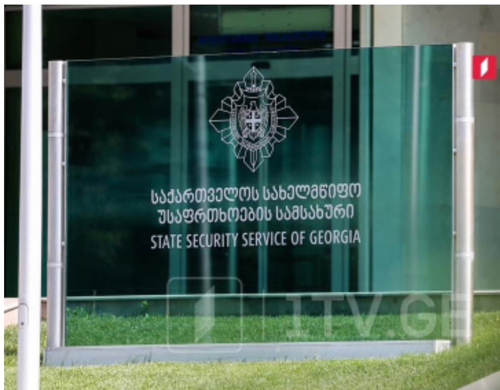
The economy minister stressed that Georgian law enforcement agencies remain 'vigilant' so that sanctioned people do not enter the country and that their businesses are traceable.

According to the SSS, "as a result of the measures taken, a calm and safe en-