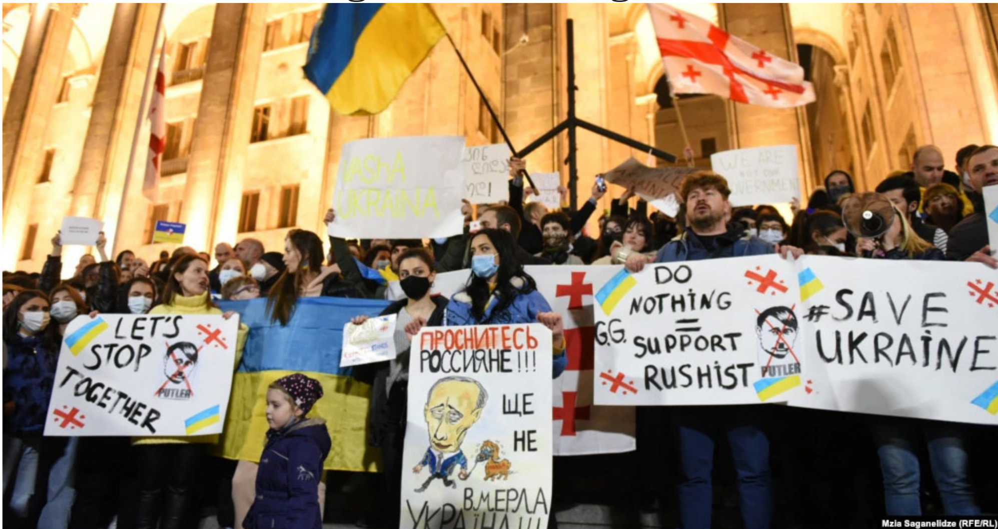
Since the Russian invasion of Ukraine, rallies are being held daily in front of the Parliament building in Tbilisi to show solidarity with Ukraine.