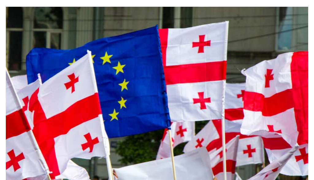
▶ EU encourages all sides to use the Parliament as the main platform for political debate.

on the basis of principles that I will not debate, but which arguably came at the expense of political inclusiveness and democratic pluralism in Parliament," the statement reads.