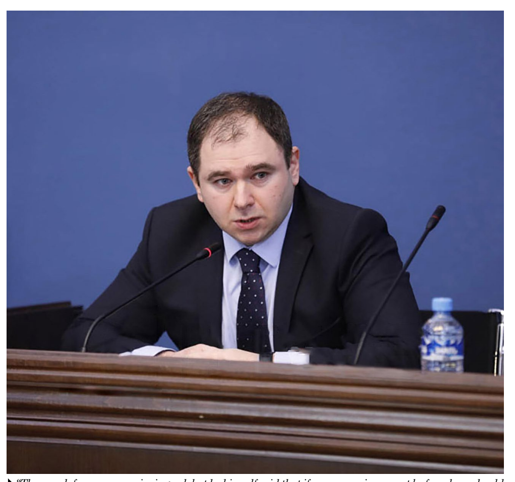
• "The search for a compromise is good, but he himself said that if a compromise cannot be found, we should not stop and continue the movement," Samkharadze said.

tical class and decision-makers should actually live up to people's expectations, not disappoint people.