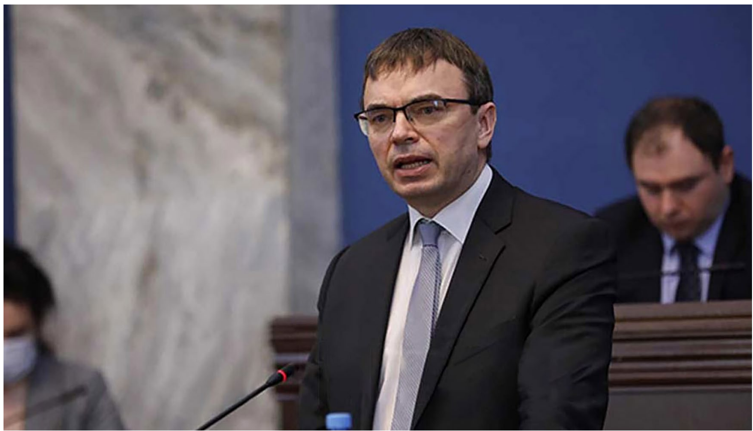
• "The European Parliament and the EU member states stand by Georgia when it comes to supporting territorial integrity, the country's right to decide its own assignment."