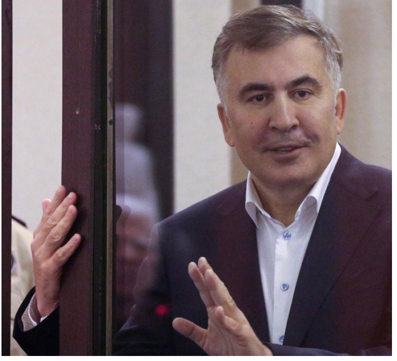
▶ The former president stresses the need for judicial reform, noting that Georgia must allow the unrestricted use of English law throughout the country.

As he notes, the current judicial system in Georgia is incapable of protecting the rights of investors because it is dependent on a particular "financial clan", claiming that in such an environment, attracting investments is unrealistic. In his opinion, the