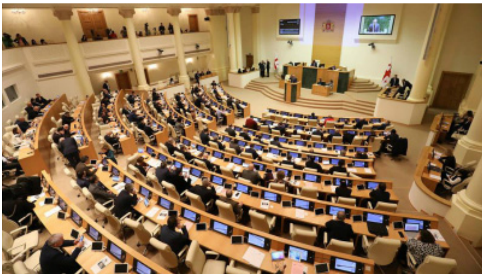
Opposition politicians refused to sign the draft citing that the text does not mention Russia as the aggressor country.

"The Georgian Parliament declares that joining NATO is a sovereign right of the state and any attempt to restrict it by military-political means is categorically unacceptable. The Parliament believes that the prevention of war in Ukraine should be a major concern for the international community," the resolution reads.