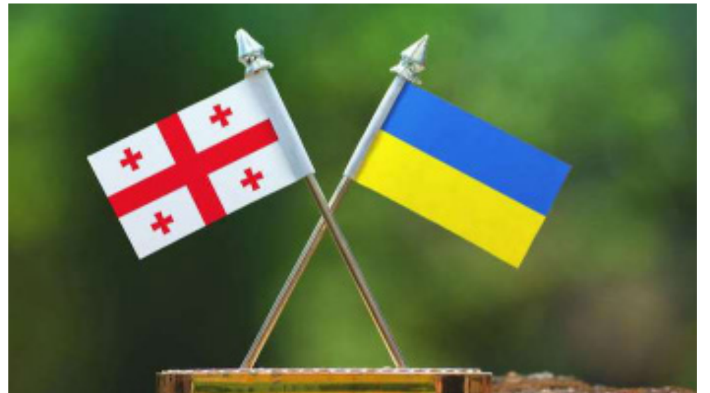
"Georgia condemns any intention that may be directed against the territorial integrity of the sovereign state, which poses a new threat not only to Ukraine but to regional peace and security," the resolution reads.

January 31, 2022, Tbilisi - The WHO and the European Union handed over 180 oxygen concentrators, 2 000 pulse oximeters and other medical equipment to the Ministry of IDPs from Occupied Territories, Labour, Health and Social Affairs of Georgia. The equipment will be used to outfit rural medical facilities to help citizens all over the country have better access to healthcare.