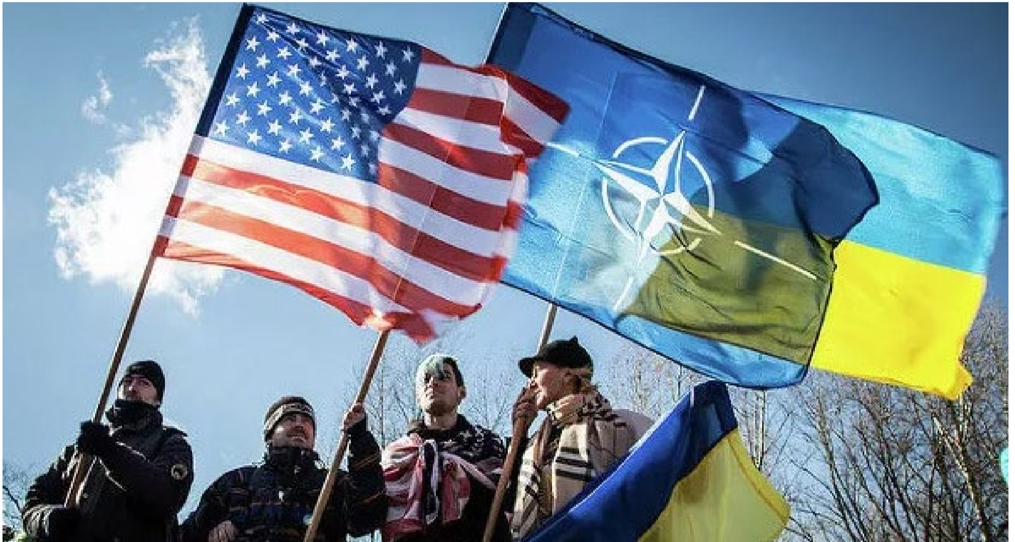
► US rules out Russian demand to halt NATO's eastward expansion, but says it is open to talks on arms control.