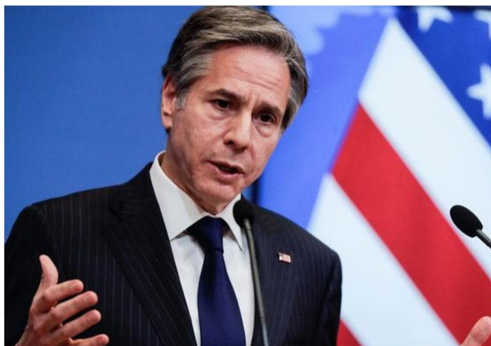
► The US and its European allies have threatened to impose harsh economic sanctions on Russia should it invade Ukraine.

"The document we've delivered includes concerns of the US and our allies and partners about Russia's actions that undermine security, a principled and pragmatic evaluation of the concerns that