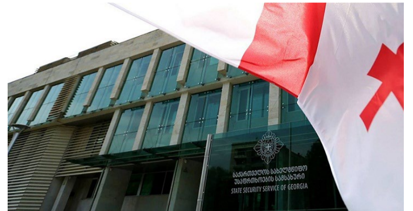
► According to the State Security Service of Georgia, the European Union Monitoring Mission (EUMM) has been informed of the issue.

European Union Monitoring Mission (EUMM) had been informed on the issue and the above will also be discussed at all relevant format meetings. Georgian Parliament Speaker