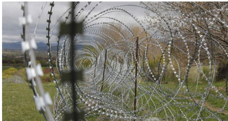
► "As locals note, occupation forces have installed the so-called 'border signs' along the separation line running in the village."

Unlawful and destructive activities are observed in the vicinity of Mejvriskhevi village near the occupied Tskhinvali region, the State Security Service of Georgia (SSG) reported. The agency did not specify the activities, however, they denied the process of illegal 'borderisation' in the vicinity of the village. According to the locals, new so-called 'border signs' have been installed by the occupation forces along the separation line running in the village. As they note, there is a danger that the part of the cemetery of the village might soon end up on the Russian occupied side due to the relocation of the so-called border.