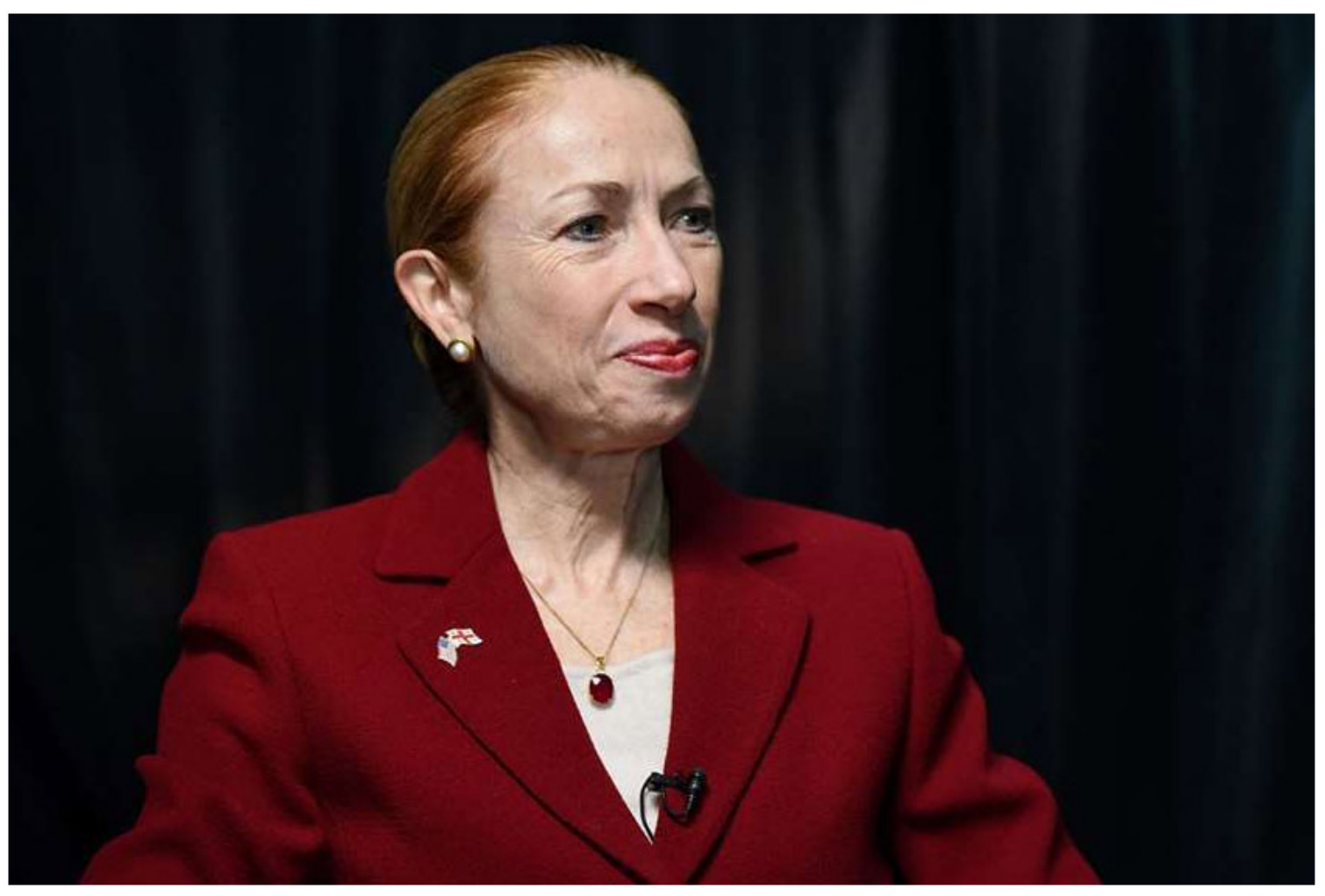
"Georgia's success as a prosperous, secure, strong democracy strengthens both our countries."