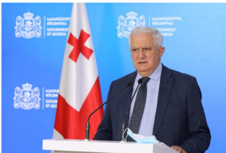
According to the Head of NCDC Amiran Gamkrelidze, it is expected to enter another peak of the pandemic at the end of February with 10-15 thousand positive cases per day.

Public Health (NCDC) Amiran Gamkrelidze said, the Omicron version is characterized by rapid transmission and tripled reinfection rate, noting that out of 1254 confirmed omicron cases, approximately 17-20% are re-infected. According to him, 50% of positive cases in the country are Omicron strain and the highest number, 65%, is recorded in Tbilisi. Gamkrelidze stated that the cases of the new strain are relatively mild compared to