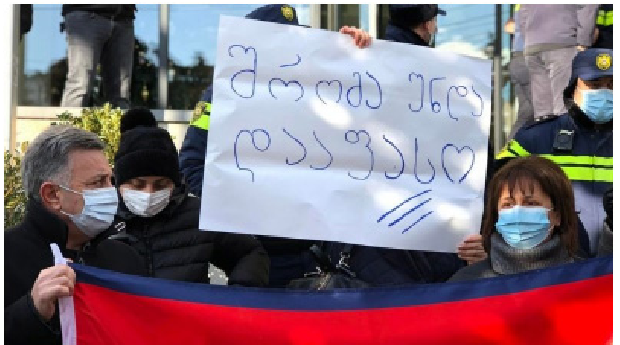
The agency management promises a 60% increase in fixed and output-based remunerations from next month, although this promise is not enough for the strikers.

"Due to their functions and workload and the working day, we think we made the appropriate decision last week and in some cases there is a 60% salary increase. In addition to salary, they can earn income for each completed declaration. In