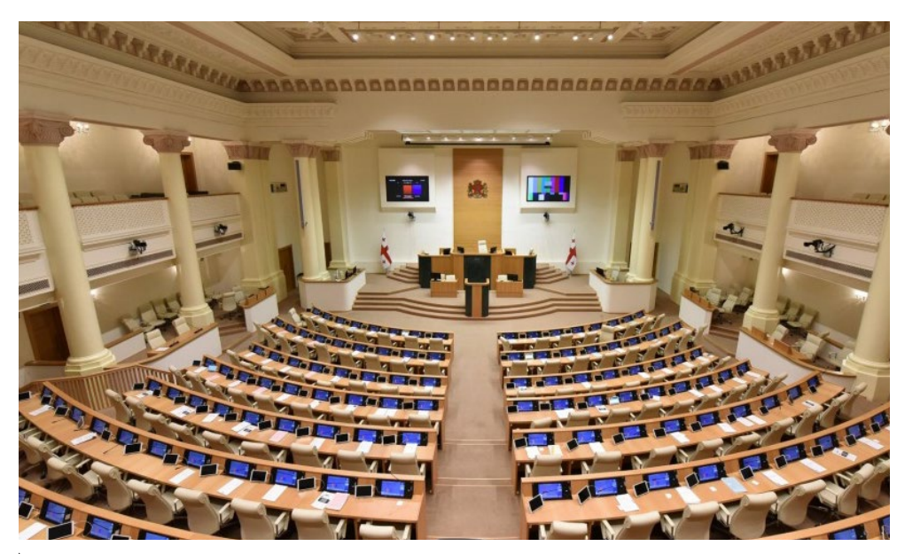
▶ Papuashvili pledges that he will be a 'guarantor of the involvement and participation of the opposition elected by the people'.

Papuashvili also stated that the country's national task is de-occupation and unification, stressing that this will be his main objective as the chairman of Parliament.