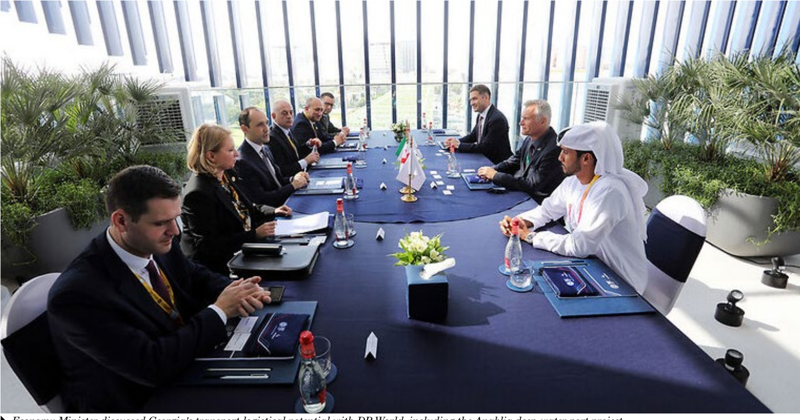
Economy Minister discussed Georgia's transport-logistical potential with DP World, including the Anaklia deep-water port project.

Within Expo 2020 in Dubai, Georgian delegation also held