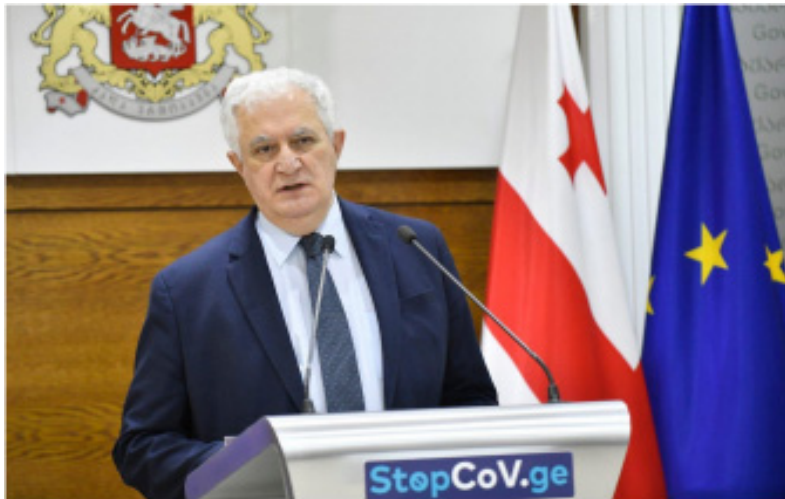
NCDC head once again called on the population to wear face-masks: "If we increase the infamous 28% rate to 90%, we will save 150-200 lives every month."