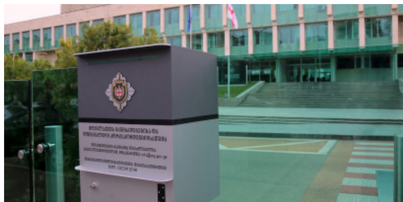
According to the State Security Service, they have activated a hotline on this issue operating through the European Union Monitoring Mission.

cerned when we hear about Georgian citizens being detained or harassed along the ABL... It is a very simple step that Russia needs to take [withdraw its forces] and that is what everyone is waiting to see in terms of ending this kind of harassment,