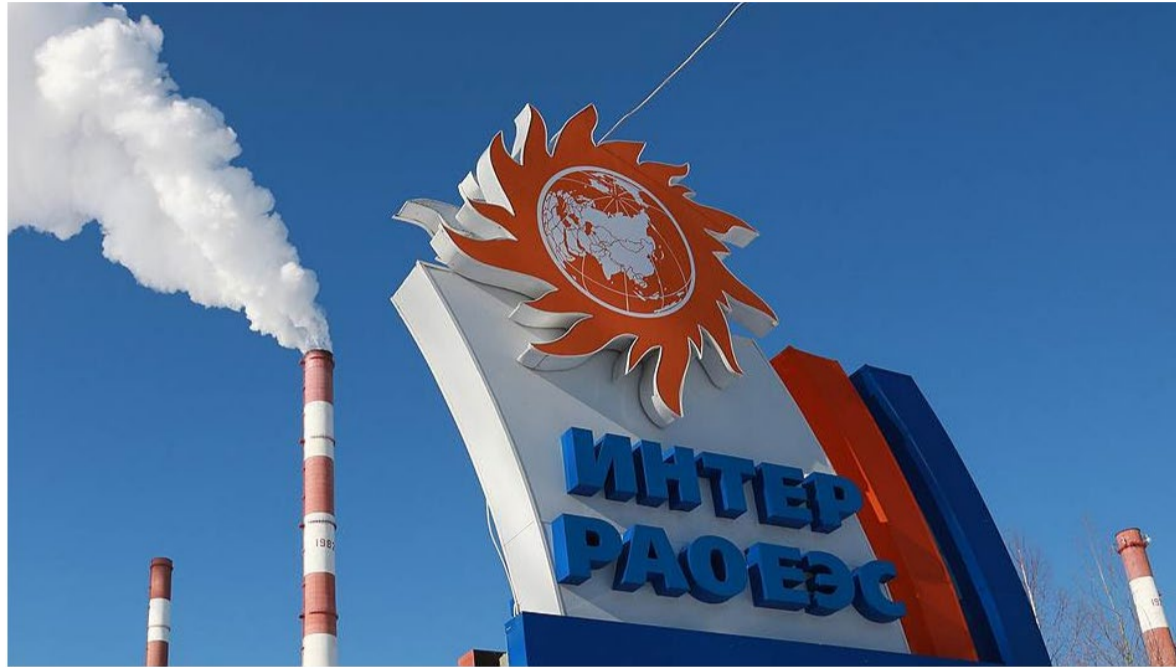
► Inter RAO argued the government breached its obligations under the 2013 Memorandum by not allowing tariff adjustments after Georgia's national currency drastically depreciated against the U.S. dollar in 2013-2016.