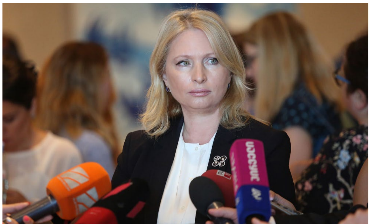
► Economy Minister Turmava said that the decision of the Georgian government not to increase tariffs for consumers despite the Arbitration Court's ruling 'was the right decision.'

There is a bilateral investment protection agreement between Georgia and the Kingdom of the Netherlands, which protects the interests of foreign investors in Georgia. Gardabani Holdings BV and another