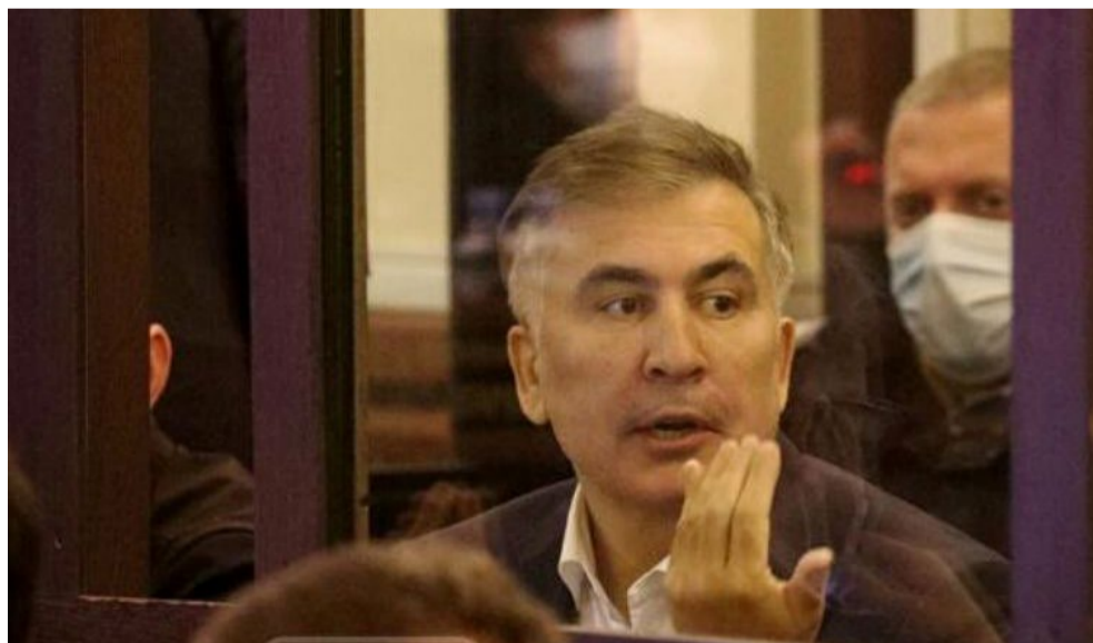
► Saakashvili is accused of mispending GEL 9 million for personal purposes.