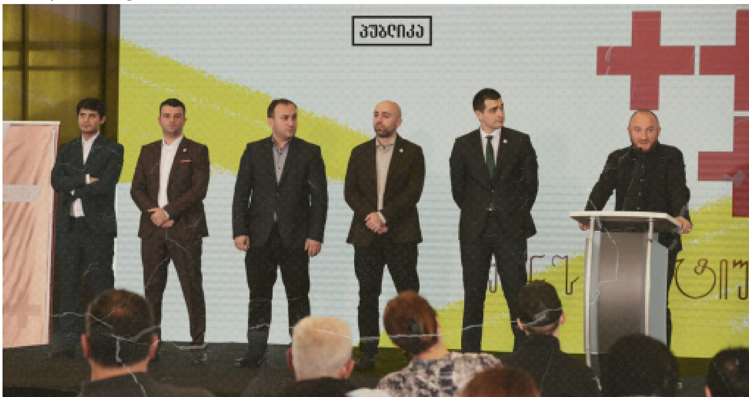
Conservative Movement ready to participate in upcoming elections, be it extraordinary or planned.

That's why a part of society thinks that a number of their actions contradict the Constitution. However, constitutionalists say it can not be assessed as a legal position of the party, and old activities can not become the legal basis to raise the issue of banning the party.