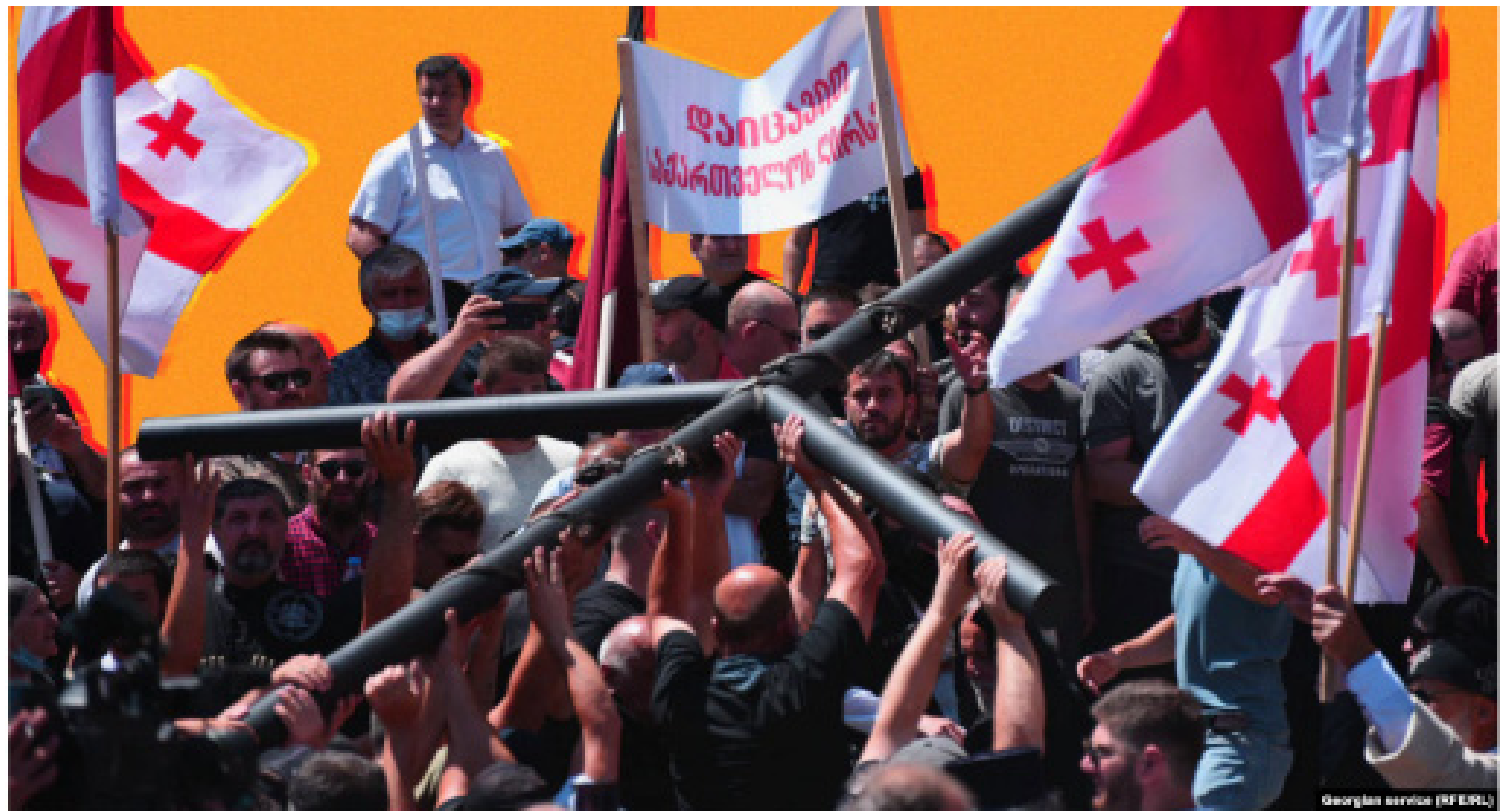
"We are ready to establish partnership and allied relations with Russia."