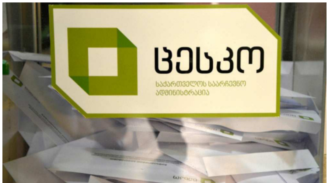
After the first round of elections, a total of 812 polling stations have been recounted nationwide.