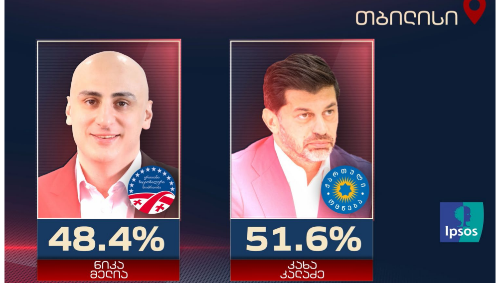
The margin of error of the survey is 3%.