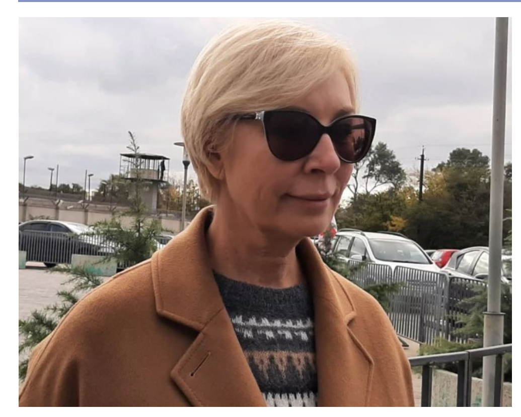
• Ombudsperson of Ukraine visited Saakashvili in prison.