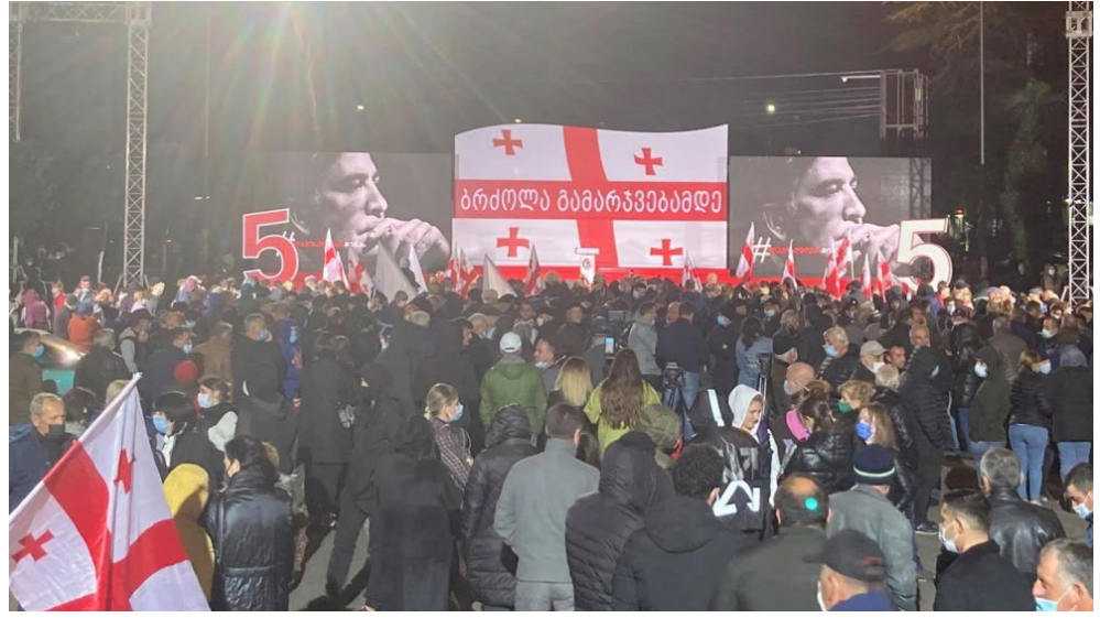
• "Fight for Victory, Fight for Misha's Freedom"

The next morning, the results of the survey, commissioned by the opposition-