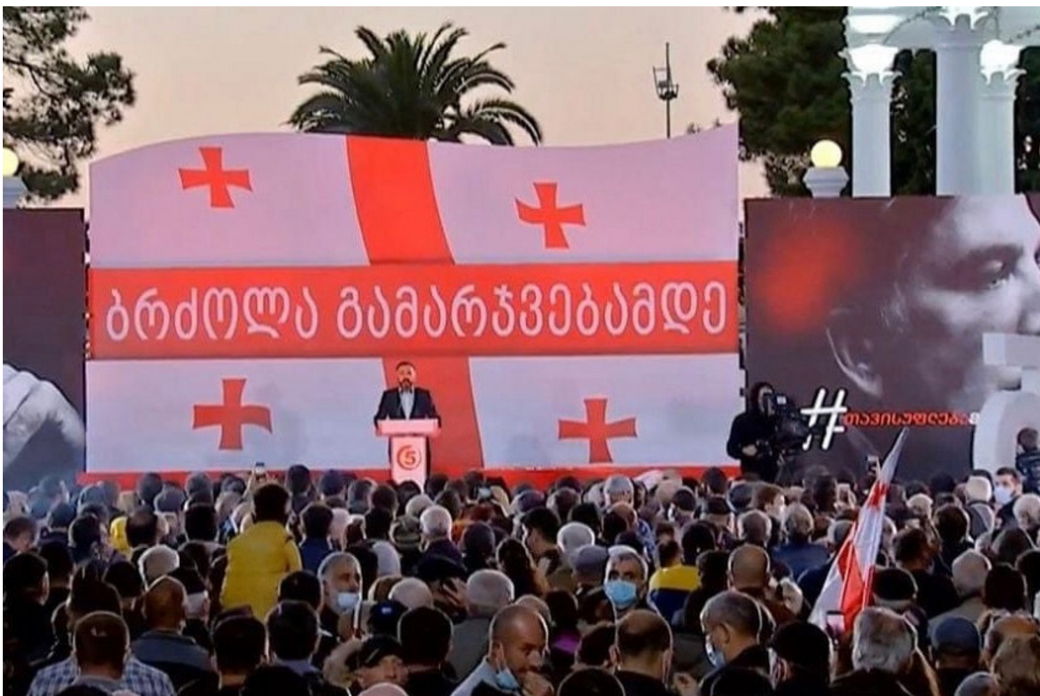
The doctors and attorneys of the former president warned that his health is rapidly declining

Saakashvili was arrested on October 1. He has been on a hunger strike for 25 days. The doctors' council working on his case recommended his hospitalization. It is still unknown when and where Saakashvili will be transferred for further medical testing.