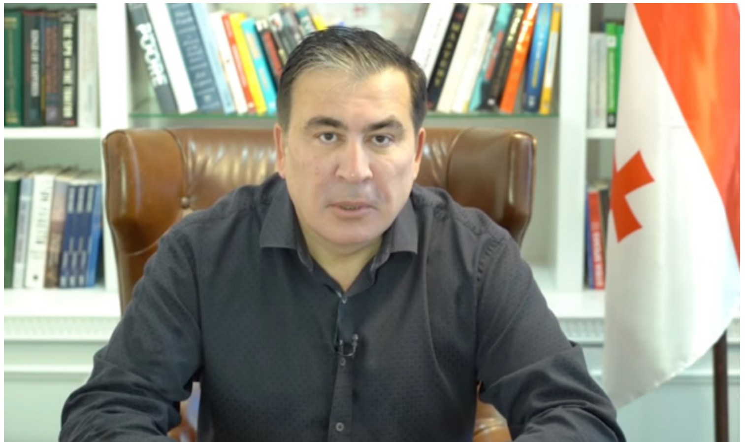
Since being imprisoned, the ex-president has been on a hunger strike

"Saakashvili's greatest risk right now is heart failure; consequently, there should be a second level of cardiology service in the prison hospital, specifically interventional cardiology. Although there