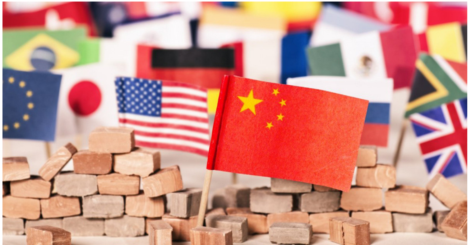
Turkey, Russia, China, Azerbaijan, and the United States were Georgia's largest trading partners by turnover.

The second on the list of export commodities was cars – $338.2 million; fol-