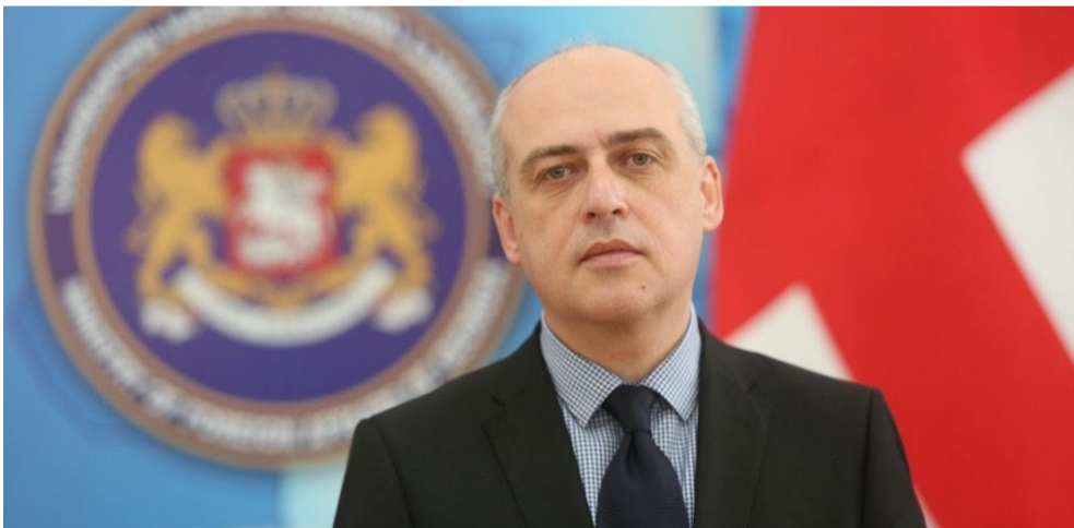
► According to Georgian Foreign Minister David Zalkaliani, the visit will significantly contribute to further deepening the existing partnership between the countries.

port for Georgia's territorial integrity, its stable and democratic development, and the Euro-Atlantic aspirations.