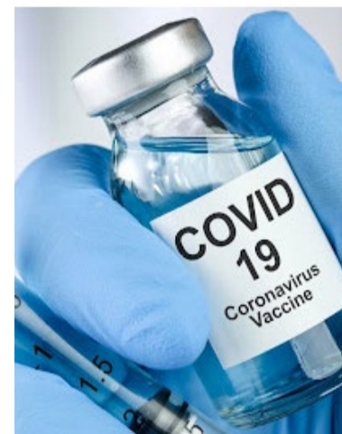
► Incidence per 100 thousand population is lowest in Tbilisi and Adjara, where the vaccination rate is high.