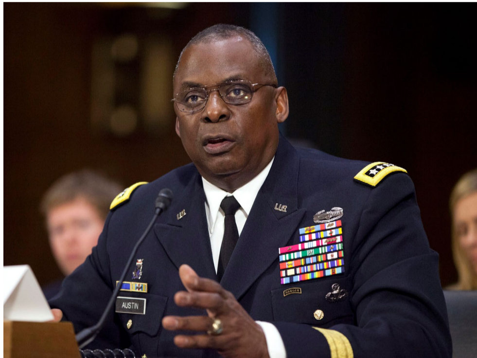
► United States Secretary of Defense Lloyd Austin will visit Georgia, Ukraine, and Romania during his trip to Europe.

Zalkaliani noted that such a high-ranking visit by Georgia's key strategic partner is another clear message of sup-